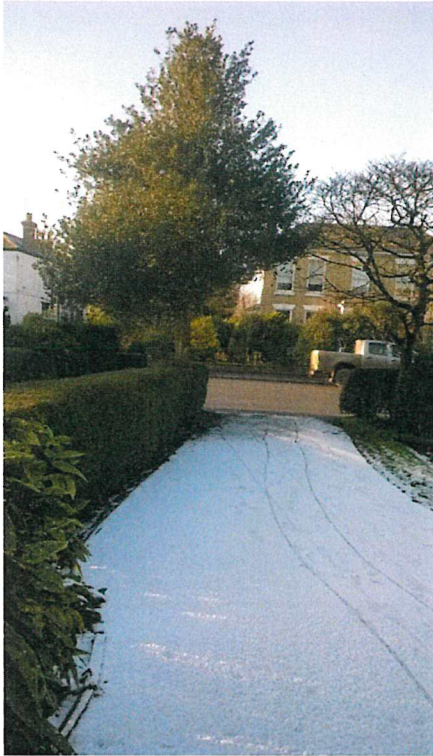
Views from Front of house