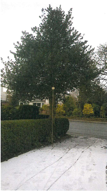
View of tree showing marker at 2.5 metres