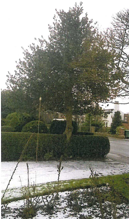
Side view with marker at 2.5 metres