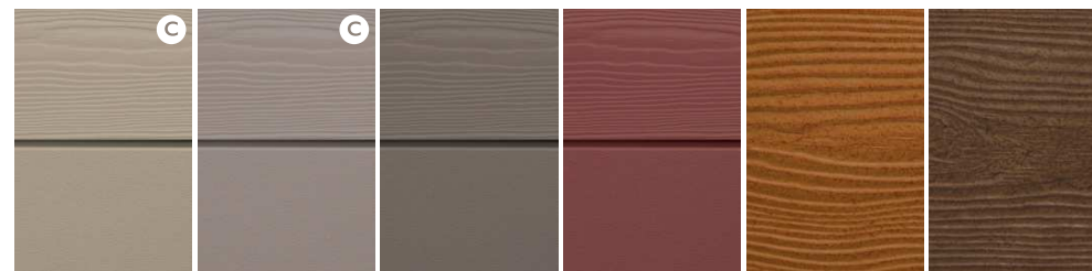
C03 Grey Brown† (RAL 1019)