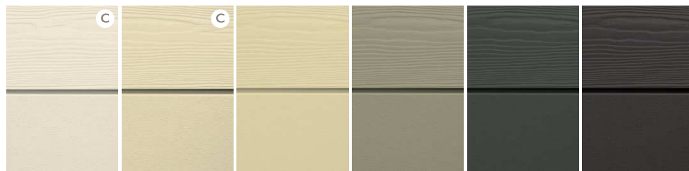
C07 Cream White† (RAL 9001)