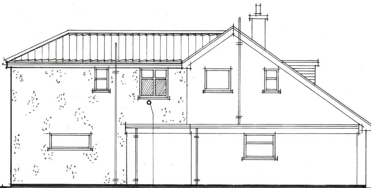
side elevation 1 / 100