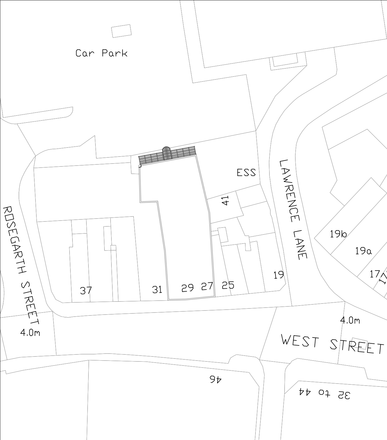
Proposed Block Plan