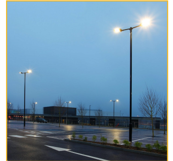
Tubular column with black finish and twin heads