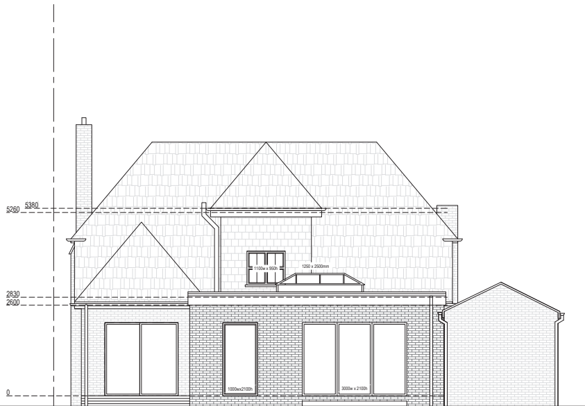
Proposed North Elevation Scale 1:50

Proposed Materials: Walls: Brick slips (to match existing) Flat roof: GRP