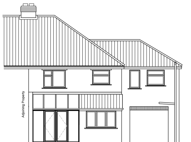
Existing Rear (East) Elevation