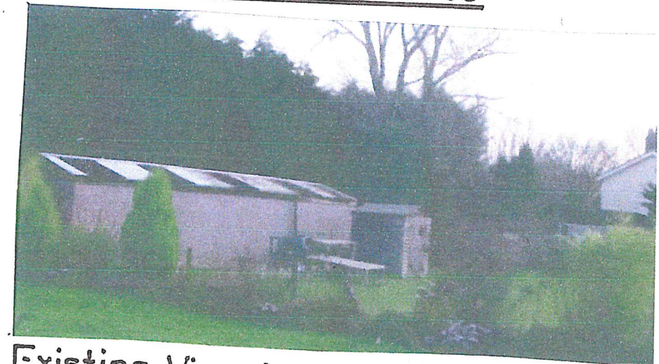
Existing View towards Outbuilds

Read all Together Drg's No's L426/ 1, 2 & 3