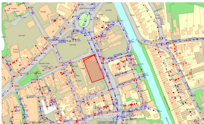
Figure 2: Showing your used water point of connection