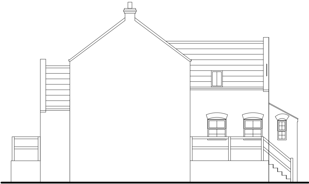
East Elevation - Proposed