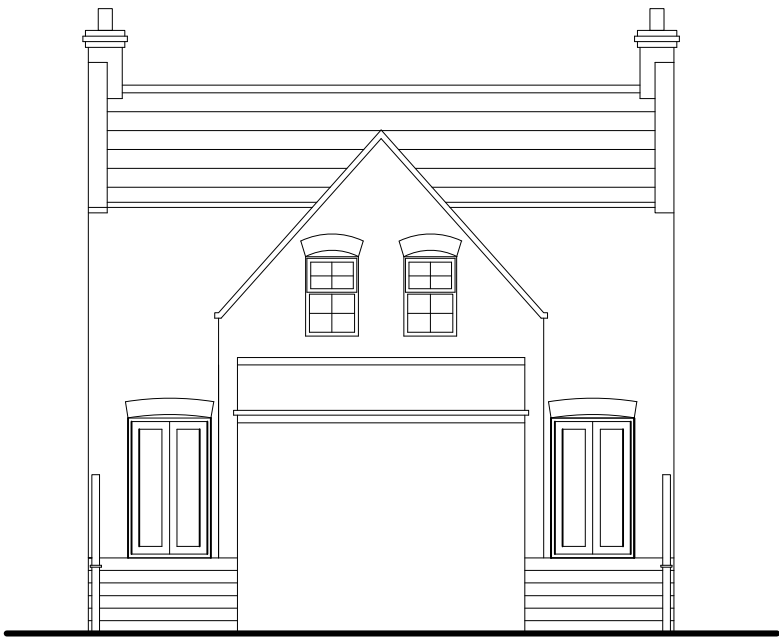
North Elevation - Proposed