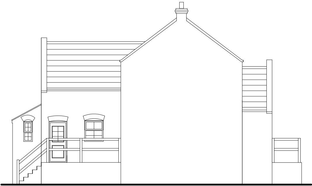
West Elevation - Proposed