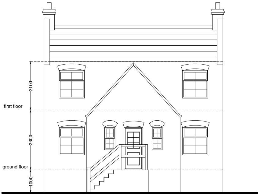
South Elevation - Proposed