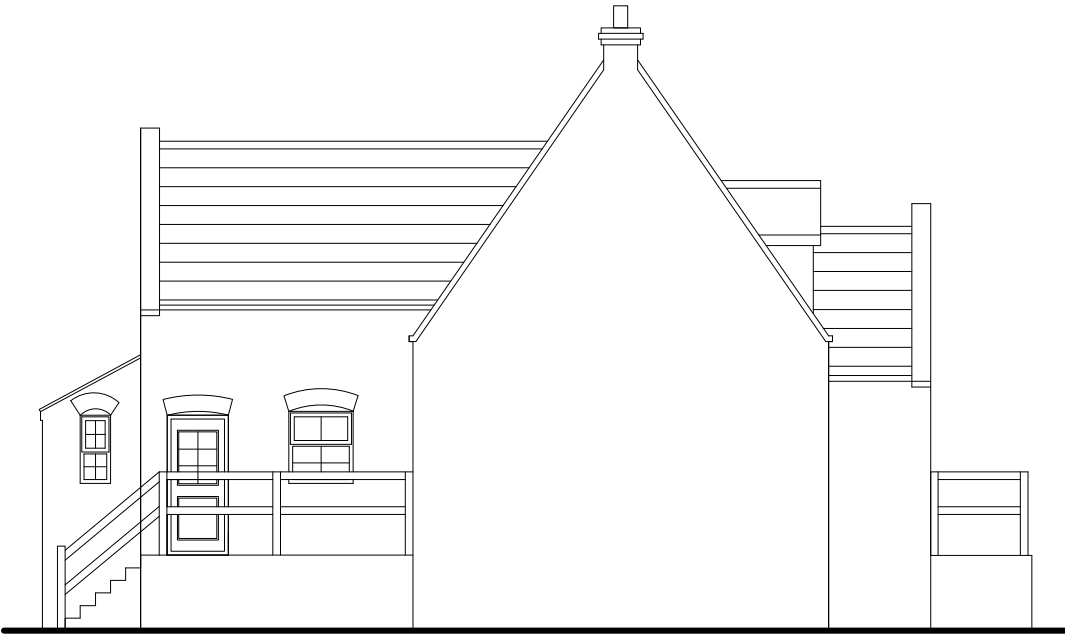
West Elevation - Existing