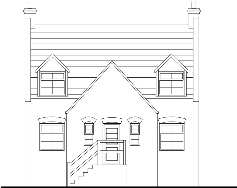
South Elevation - Existing