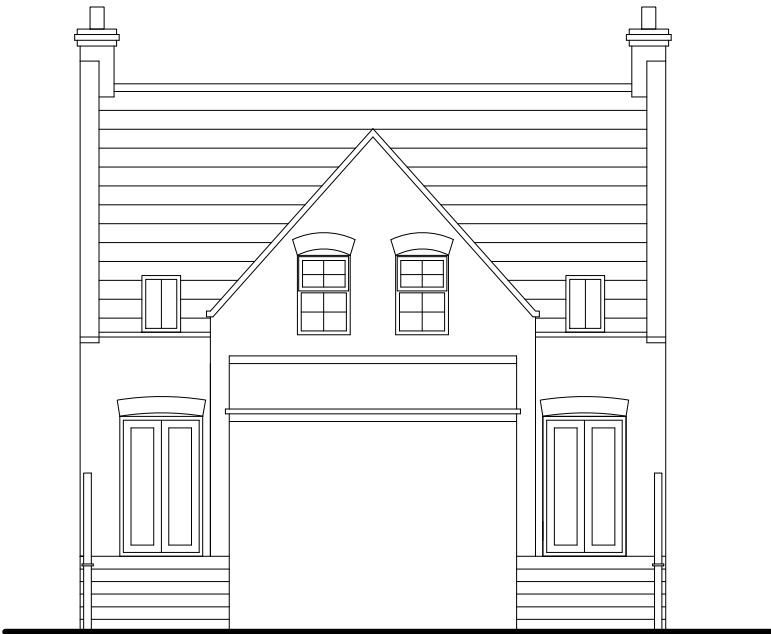
North Elevation - Existing