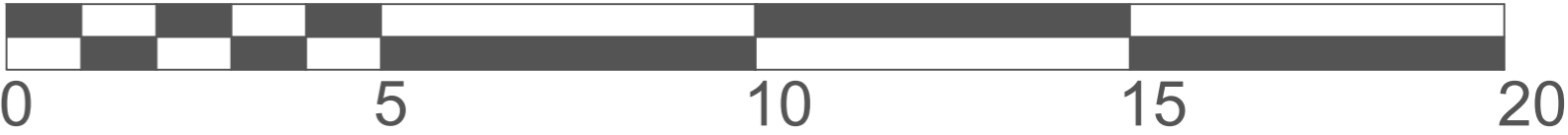
SCALE BAR 1:100