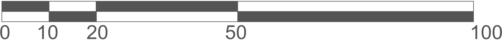
SCALE BAR 1:500