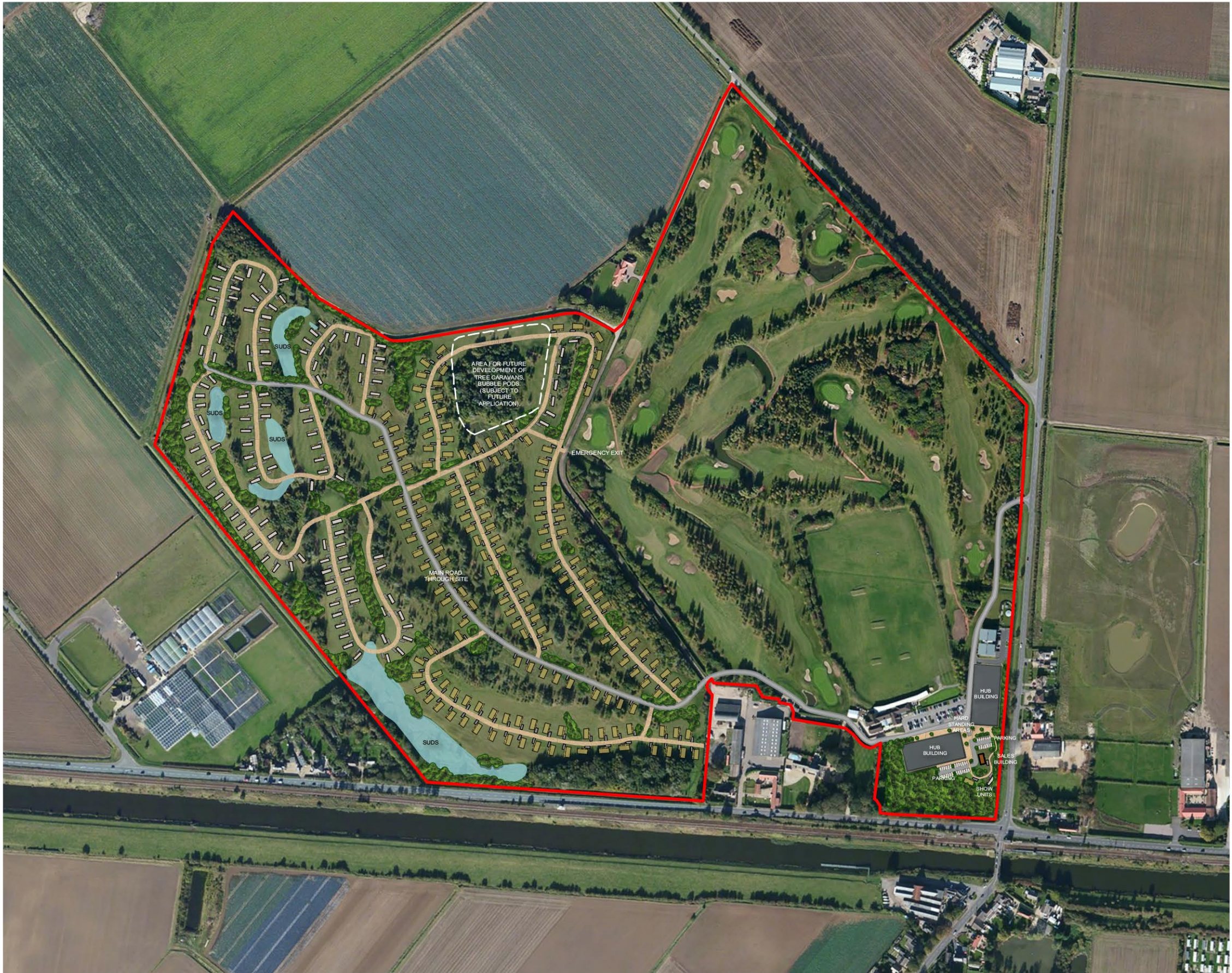
Background aerial image extracted from Bing Maps 2019