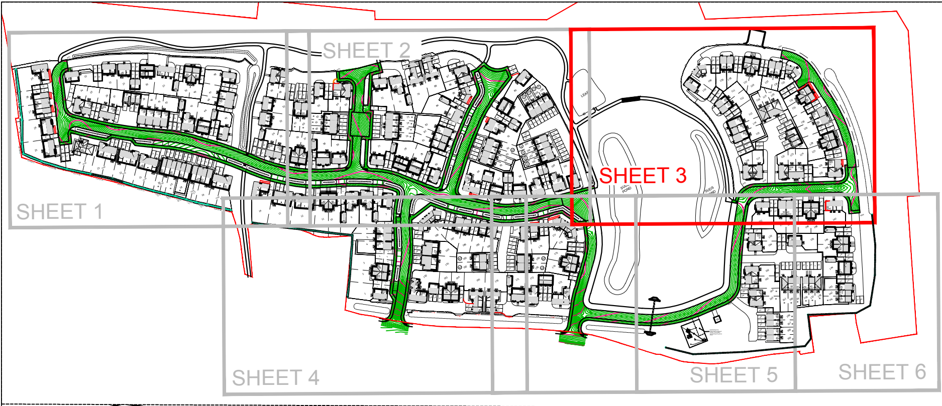
OVERALL SITE LAYOUT Scale 1:2500