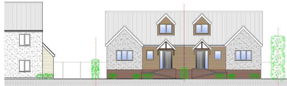
ELEVATION VISUAL SCALE 1:200 - INDICATIVE

Copyright L.P.C Architectural Design. Do Not Scale This Drawing Notes: - All dimensions to be checked & confirmed on site prior to commencement of works - All structural elements to be checked & installed strictly in accordance with structural engineers & manufactures details & specifications. - All foul & surface water drainage systems to be checked & confirmed on site prior to commencement of works.