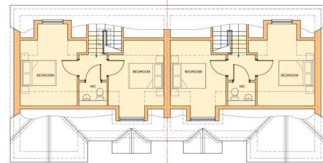
FIRST FLOOR SCALE 1:200 - INDICATIVE