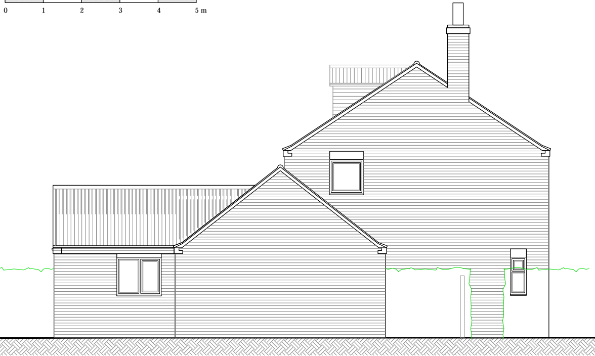
Architectural elevation drawing of a building facade. The drawing shows a main building with a gabled roof and a chimney, and a proposed extension with a flat roof and large windows. A blue dimension line indicates the 'EXTENSION' area. A green hatched area represents a garden or landscaping feature.