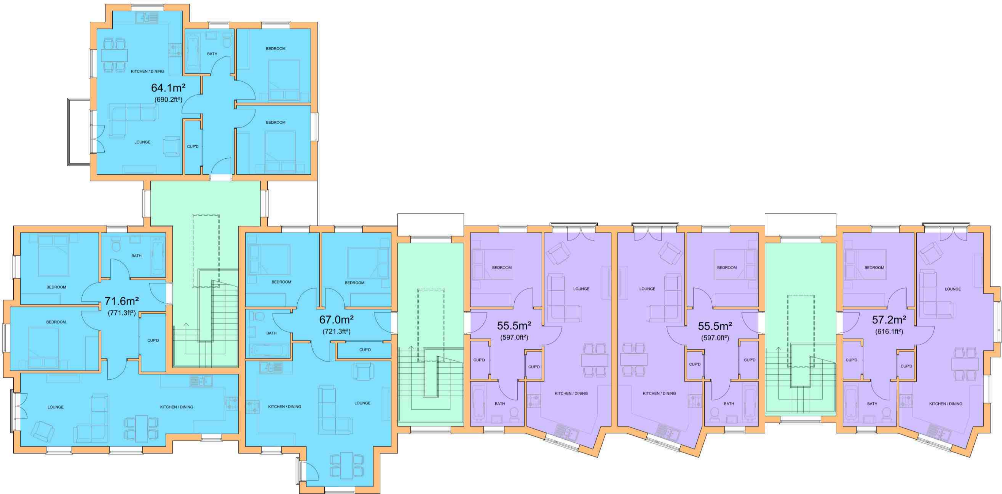
SECOND FLOOR LAYOUT 466.67m 2 (5023.28ft 2 )