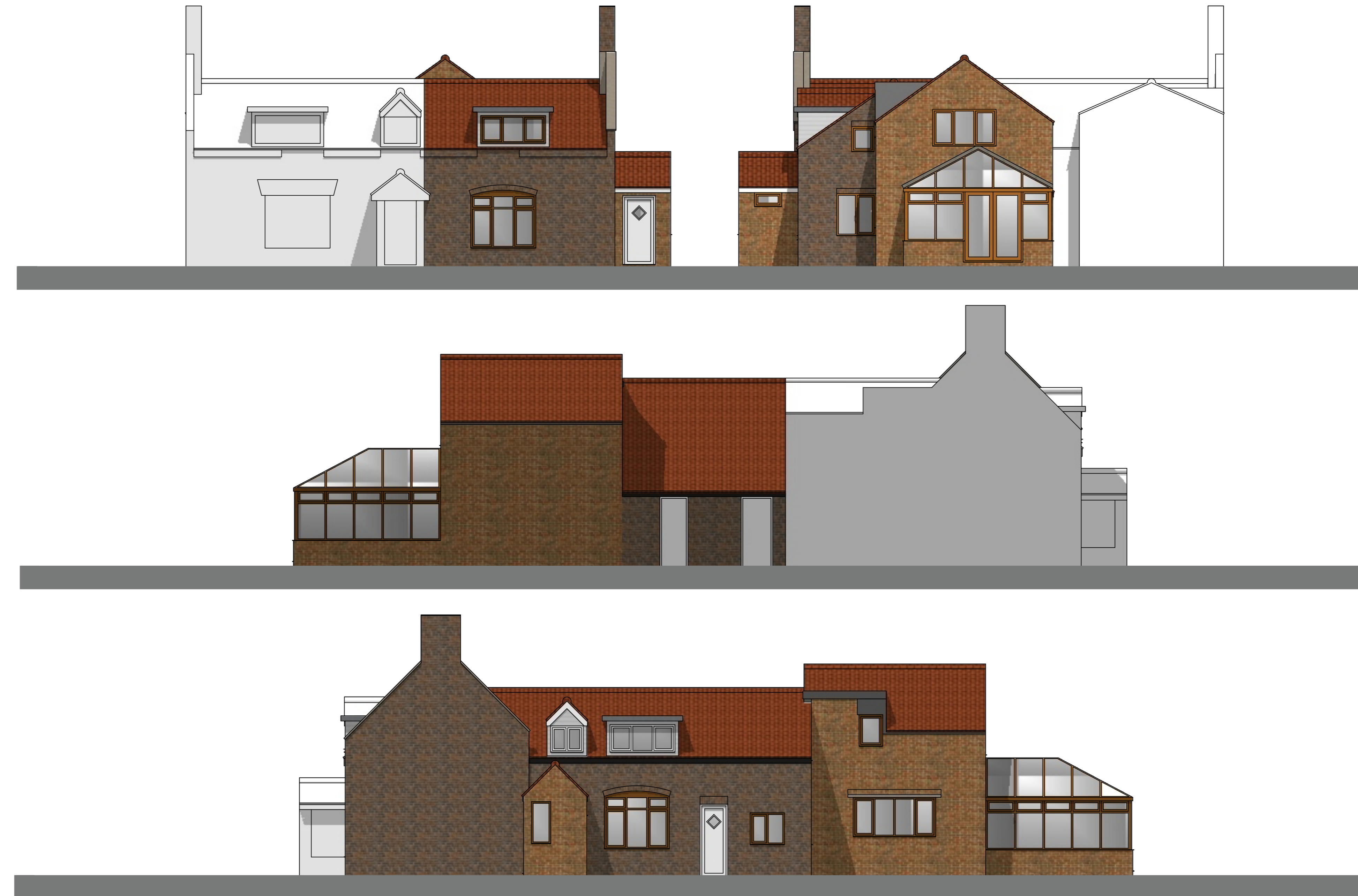
PLANS AND ELEVATIONS AS EXISTING