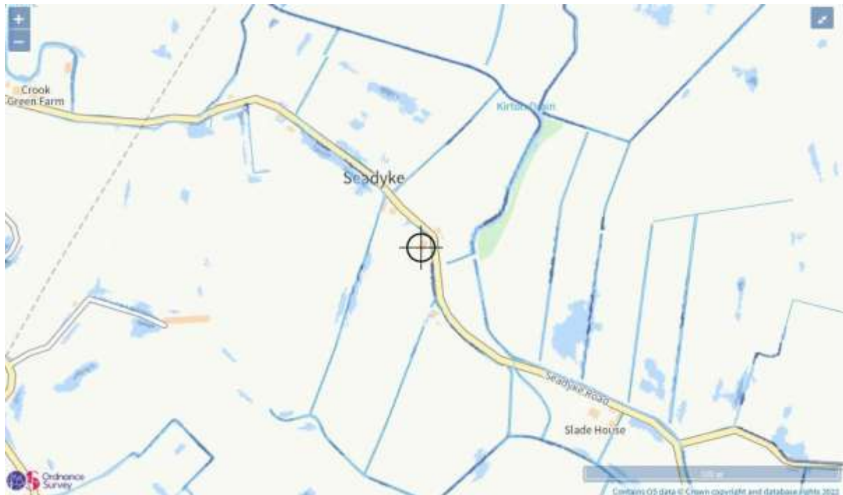
Figure 3: Surface Water Flood Map ( www.gov.uk )

The risk of flooding from surface water is very low. The following map shows the Environment Agency's Risk of Flooding from Surface Water map: