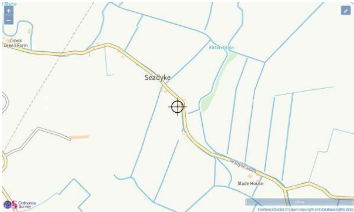
Figure 4: Reservoir Flood Map

The risk of flooding from reservoirs is low. The following map shows this on the Environment Agency's Risk of Flooding from Reservoirs map: