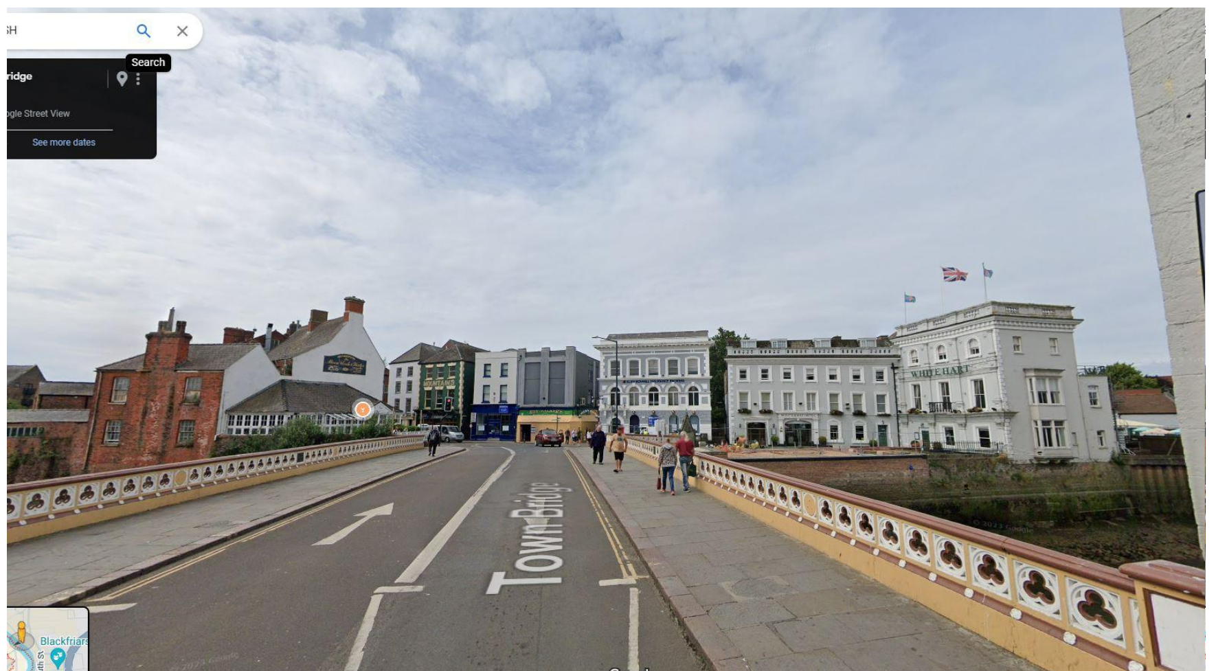
View from Town Bridge

Given that the neighbouring properties, including the listed White Hart have illuminated signage that is visible from the Town Bridge(see below), we feel that illuminated signage on the gable end of Moon Under Water is essential.