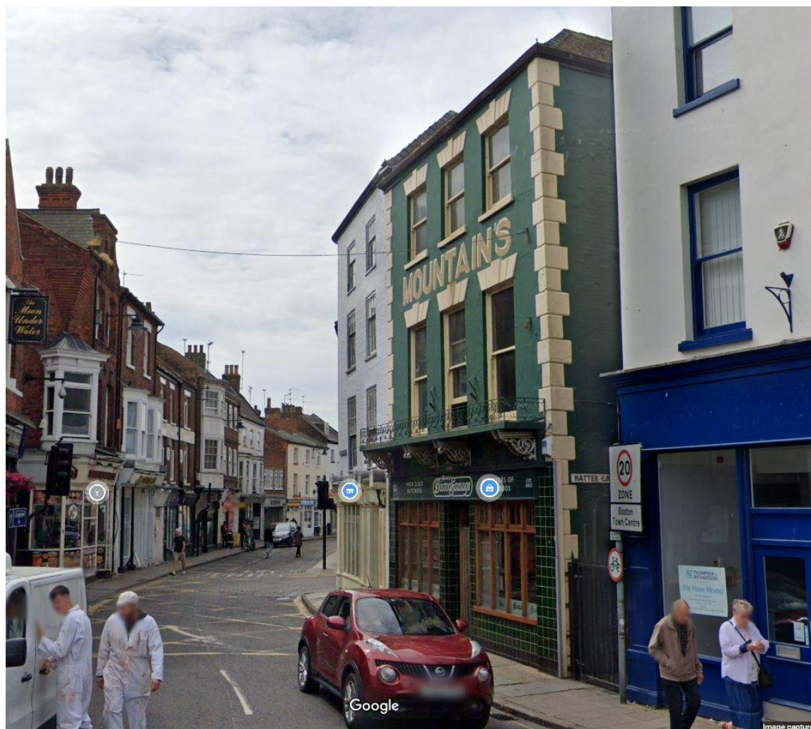
13 & 15 High St