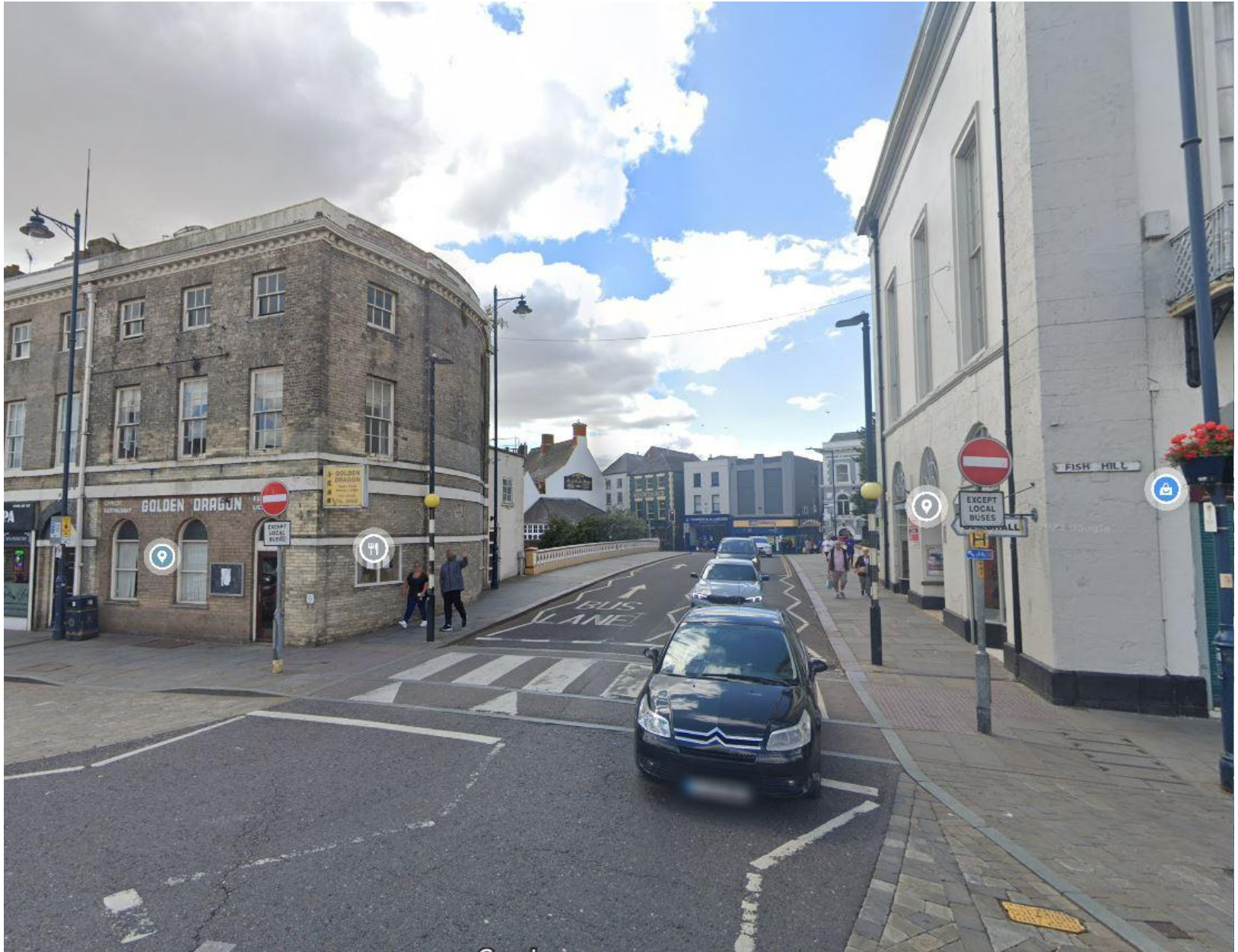
View from Market Place

It is our view that the proposed works will not negatively affect the Boston Town Centre or the listed buildings in the vicinity of the building.