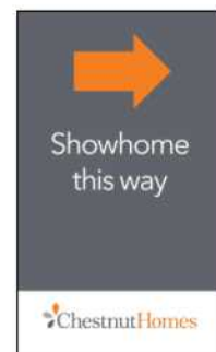
Sign A - Side 1 1500 (H) x 900mm (W) Bottom of sign 200mm above ground level