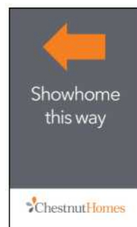
Sign A - Side 2 1500 (H) x 900mm (W) Bottom of sign 200mm above ground level