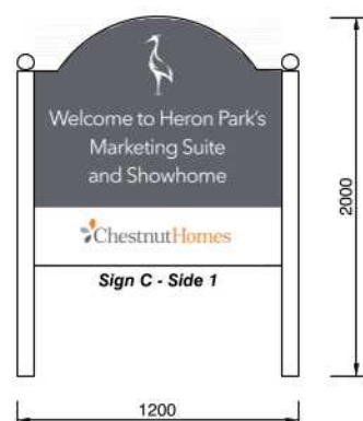
Sign C - Side 1