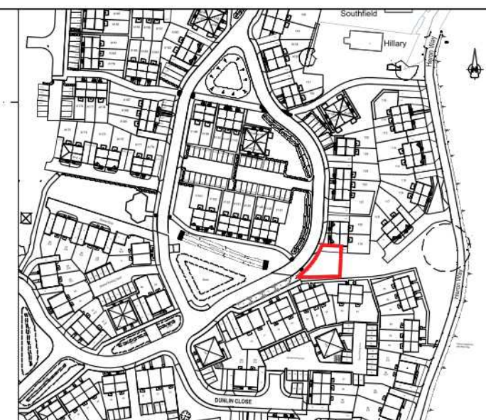
Location Plan @ 1:2500