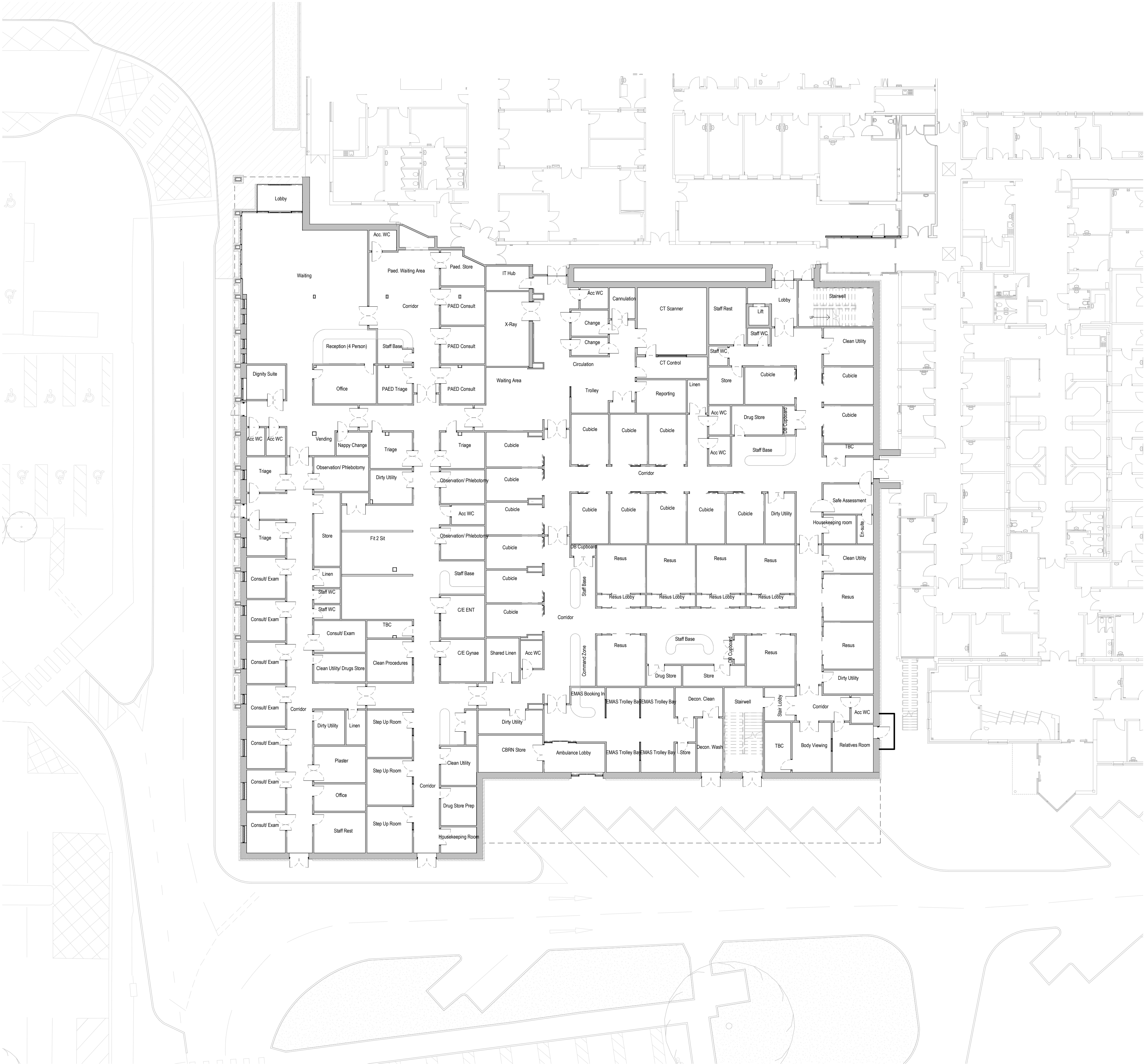
1: GROUND FLOOR PLAN 1 : 200