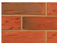
Chimneys to match with main house brick.