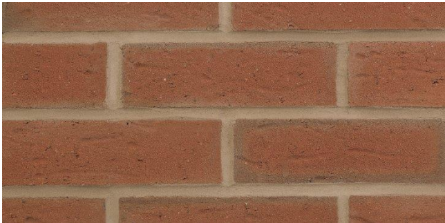
Chimneys to match with main house brick.