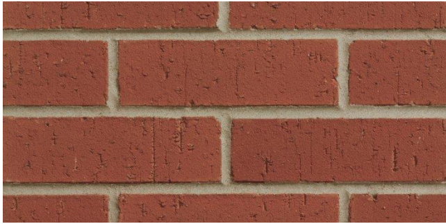
Chimneys to match with main house brick.