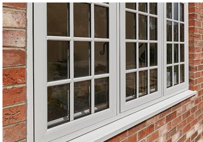
White flush casement