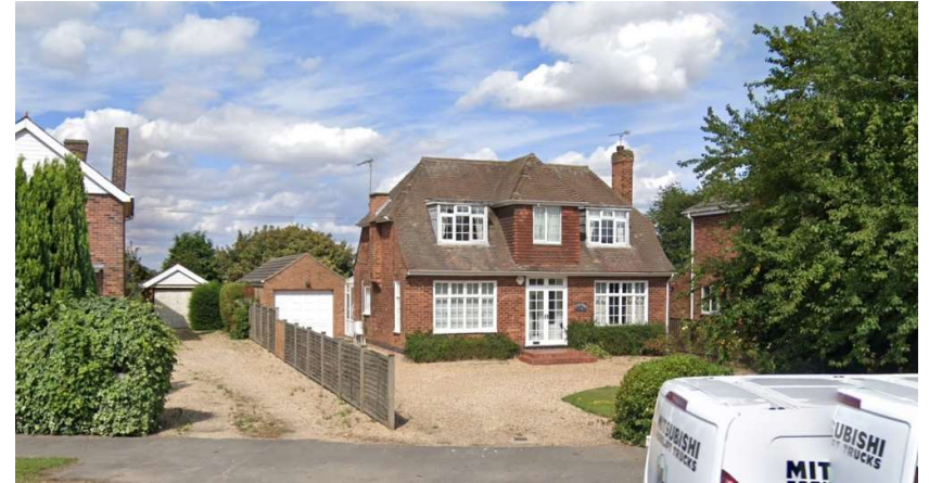
Image of Front Elevation

The application site is located on the northern side of Wainfleet Road in Boston.