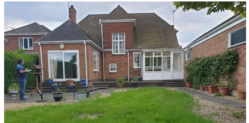
Image of Rear Elevation