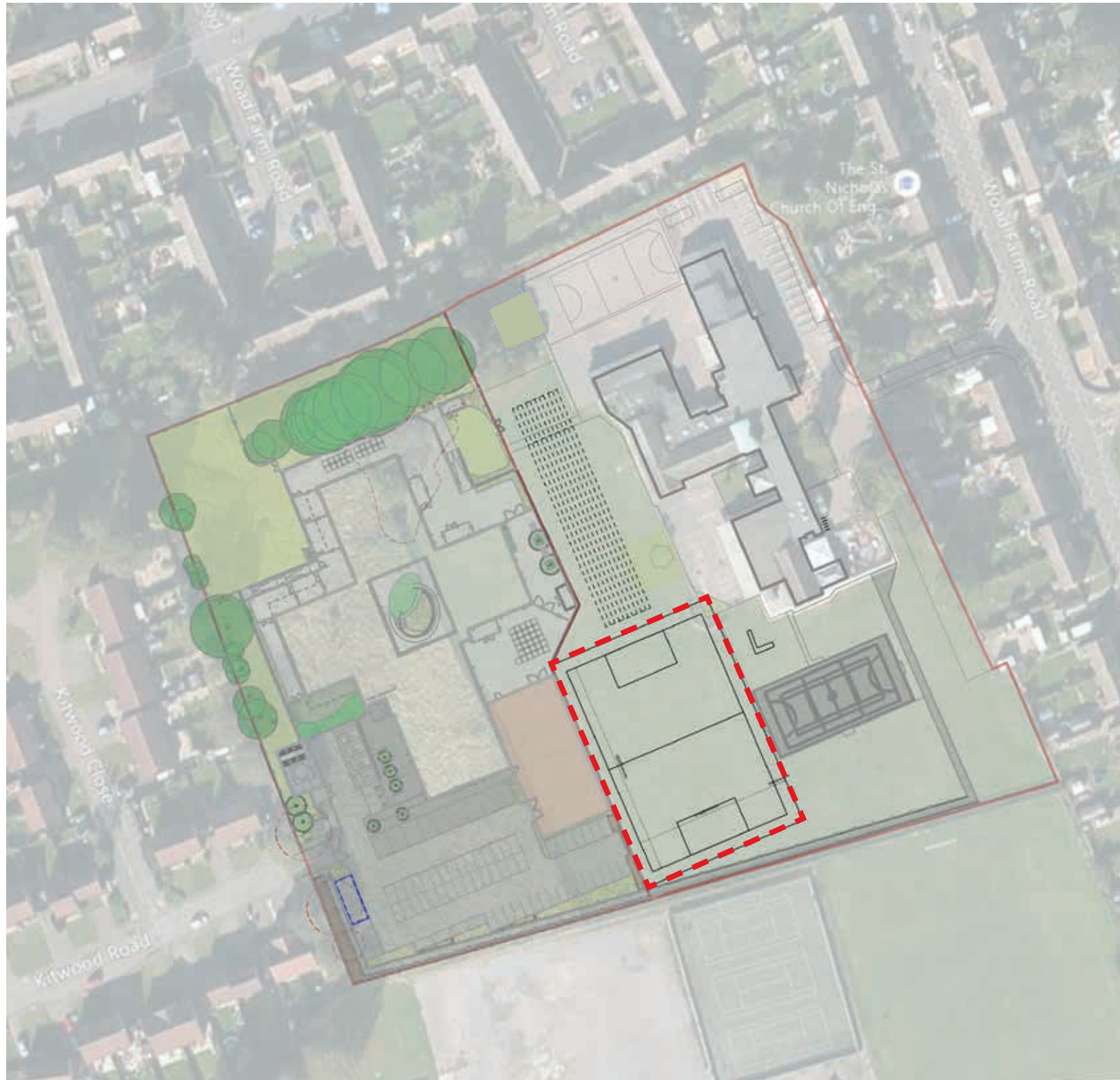
Fig 1. Scope of Work

The purpose of the Maintenance Plan is to guide the establishment and maintenance of the landscape works for a period of 5 years following completion, as well as to provide a basic framework and standard for maintenance beyond the 5 years.