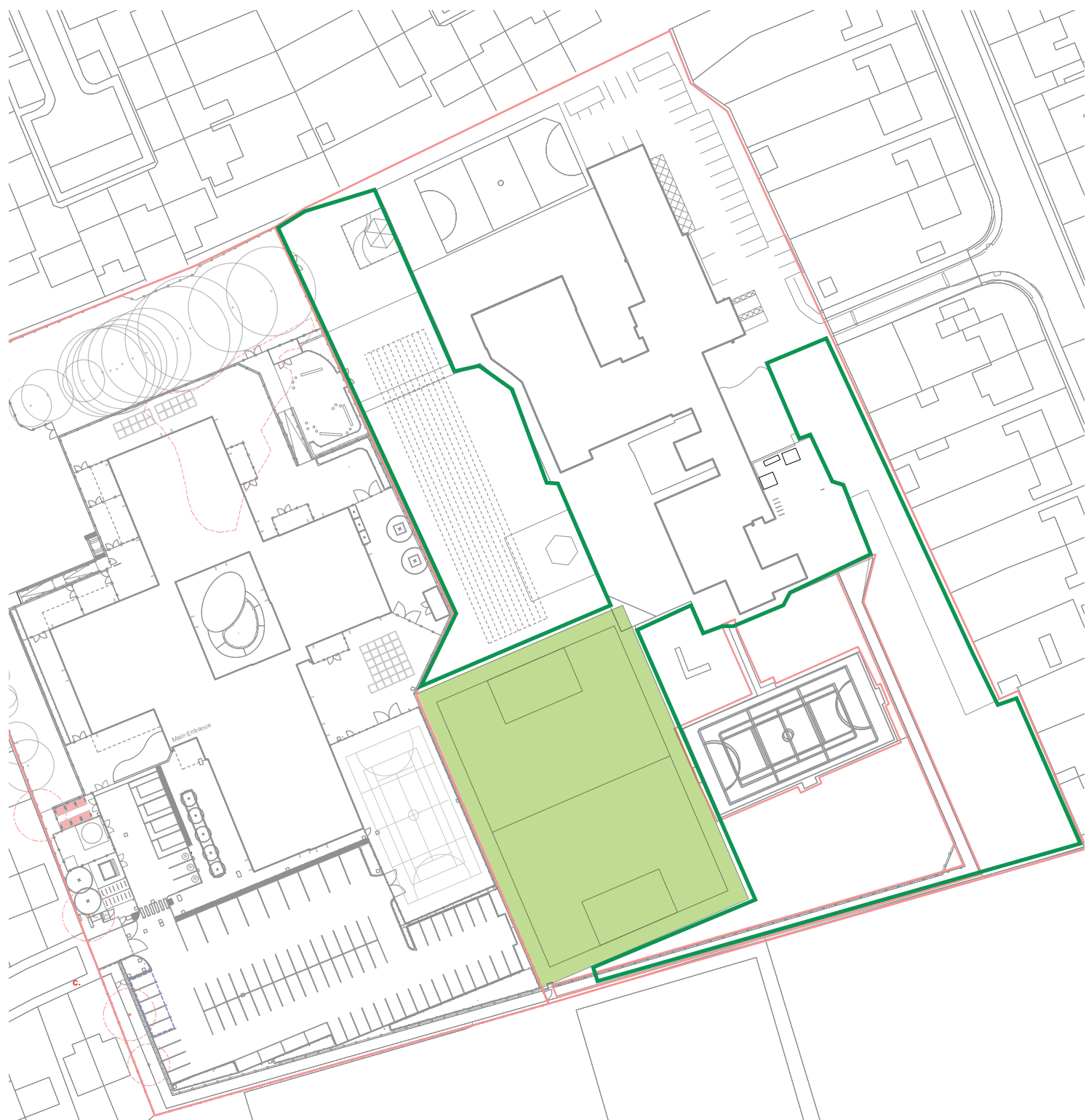
Fig 2. Pitch Typologies