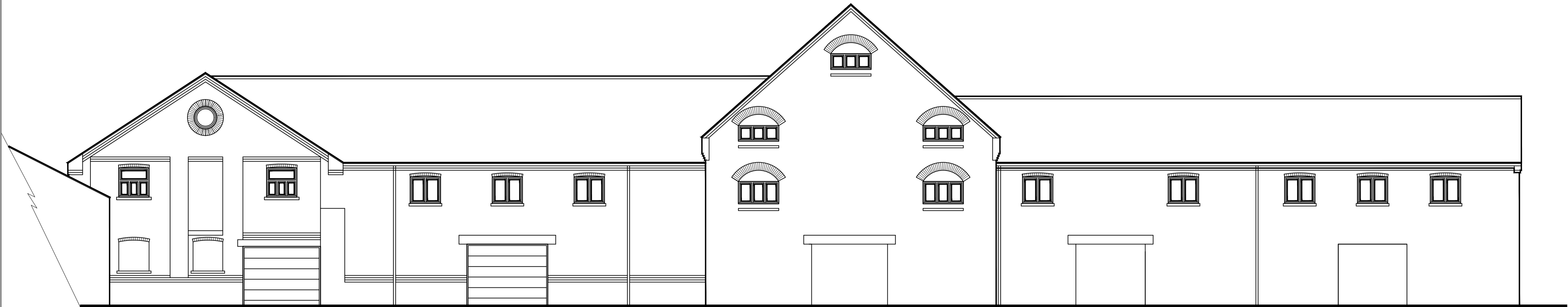
NORTH ELEVATION SCALE 1:100