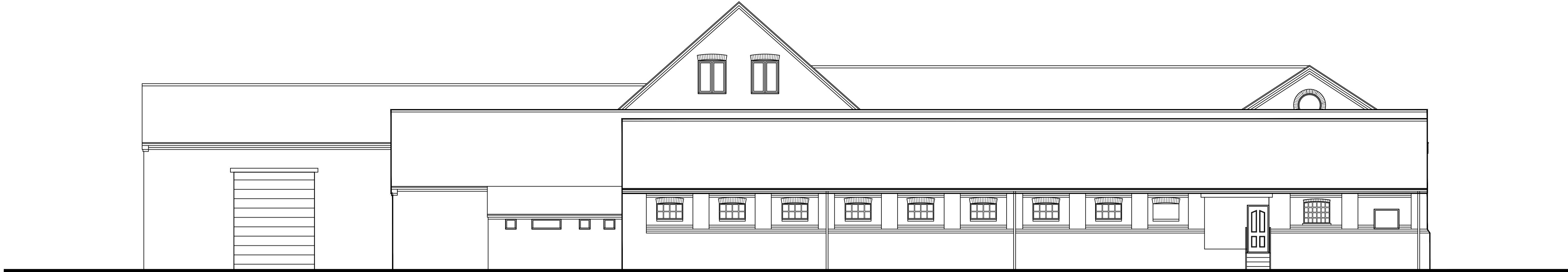
SOUTH ELEVATION SCALE 1:100