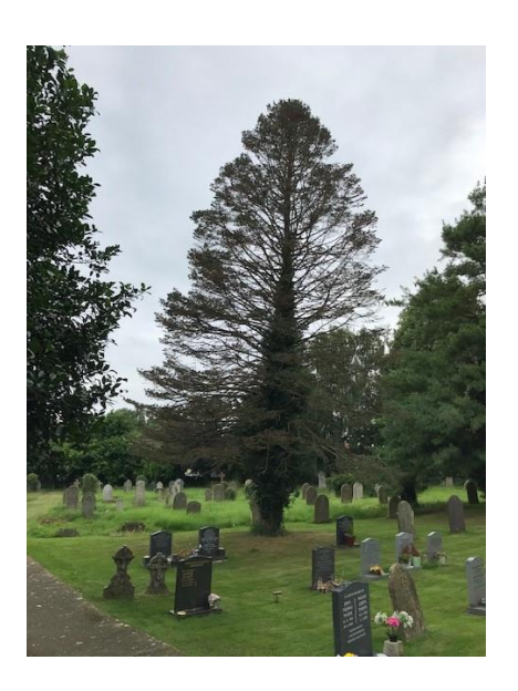
T7- (Conifer)- This is an overgrown conifer. They do not like being heavily pruned and so a small reduction is reasonable. The tree does not warrant a TPO.

T6- (Fir)- This is near to a footpath to a different part of Church Lane. It is also close to the west entrance to the church, where people can congregate. It is clearly failing and removal is reasonable.