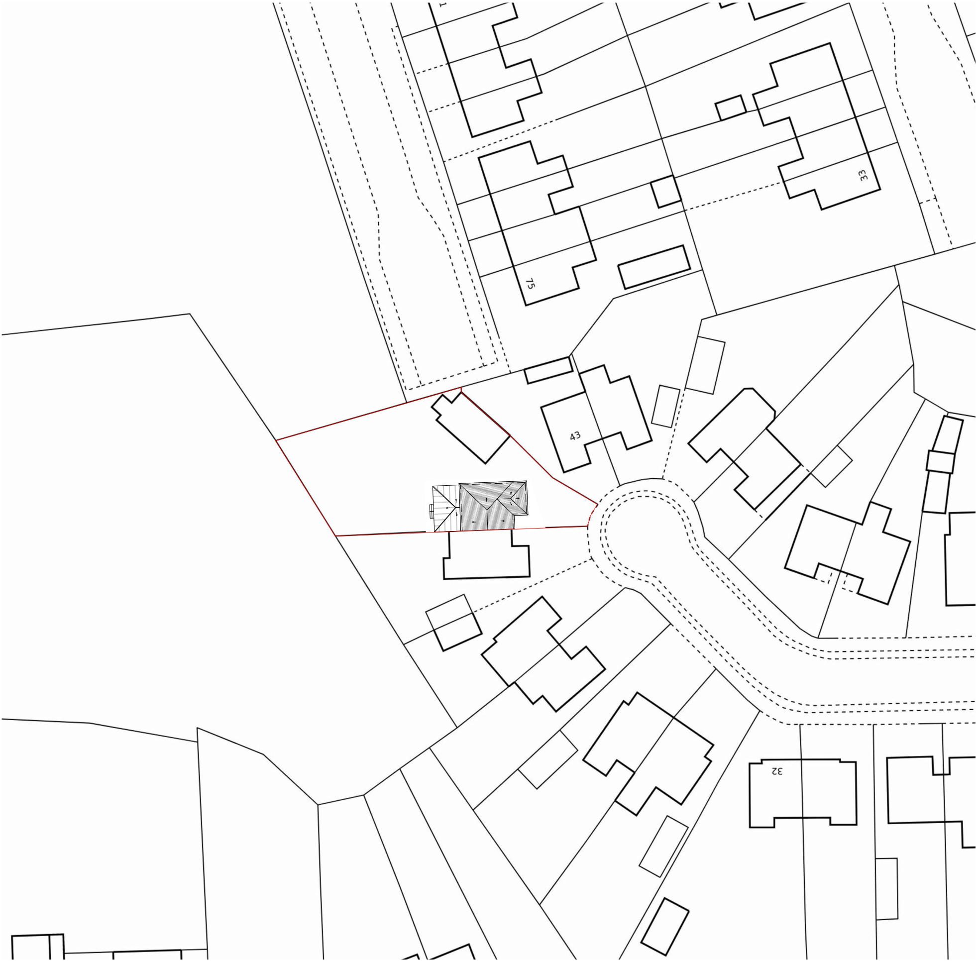
Existing Block Plan

Any dimensions shown should be checked on site and discrepancies reported to the Architect prior to construction. Designs are not coordinated with engineer projects. Do not scale for construction purposes.