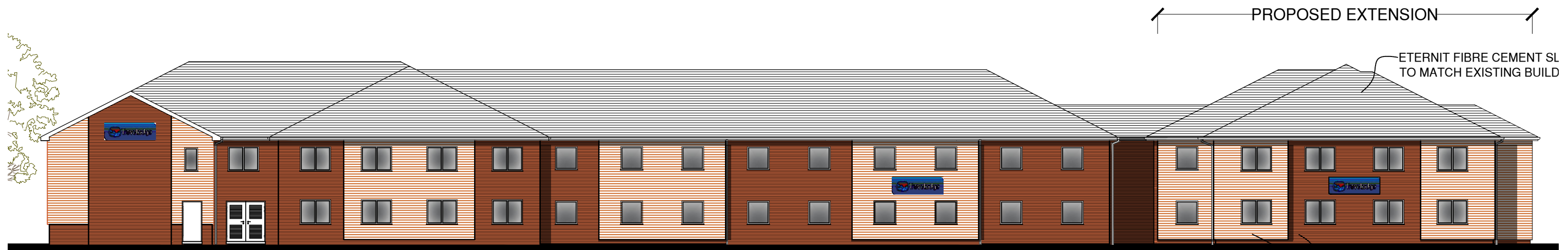
REAR ELEVATION - EAST