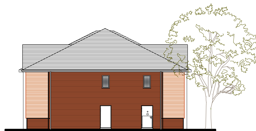
SIDE ELEVATION - SOUTH (No Changes Proposed)

NOTE All new windows and doors to match existing building. Ground Floor FFL 4.1m to match existing and conform to EA requirements.