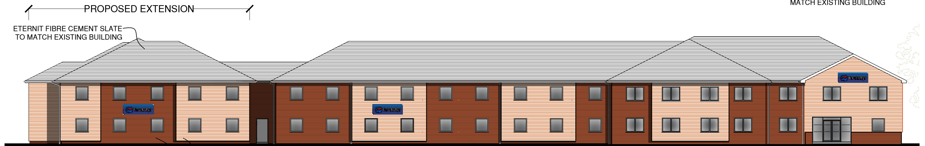
FRONT ELEVATION - WEST