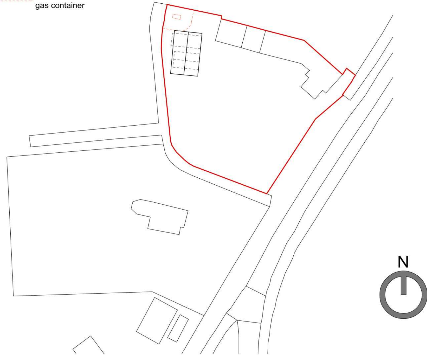
PROPOSED SITE LAYOUT PLAN 1:500