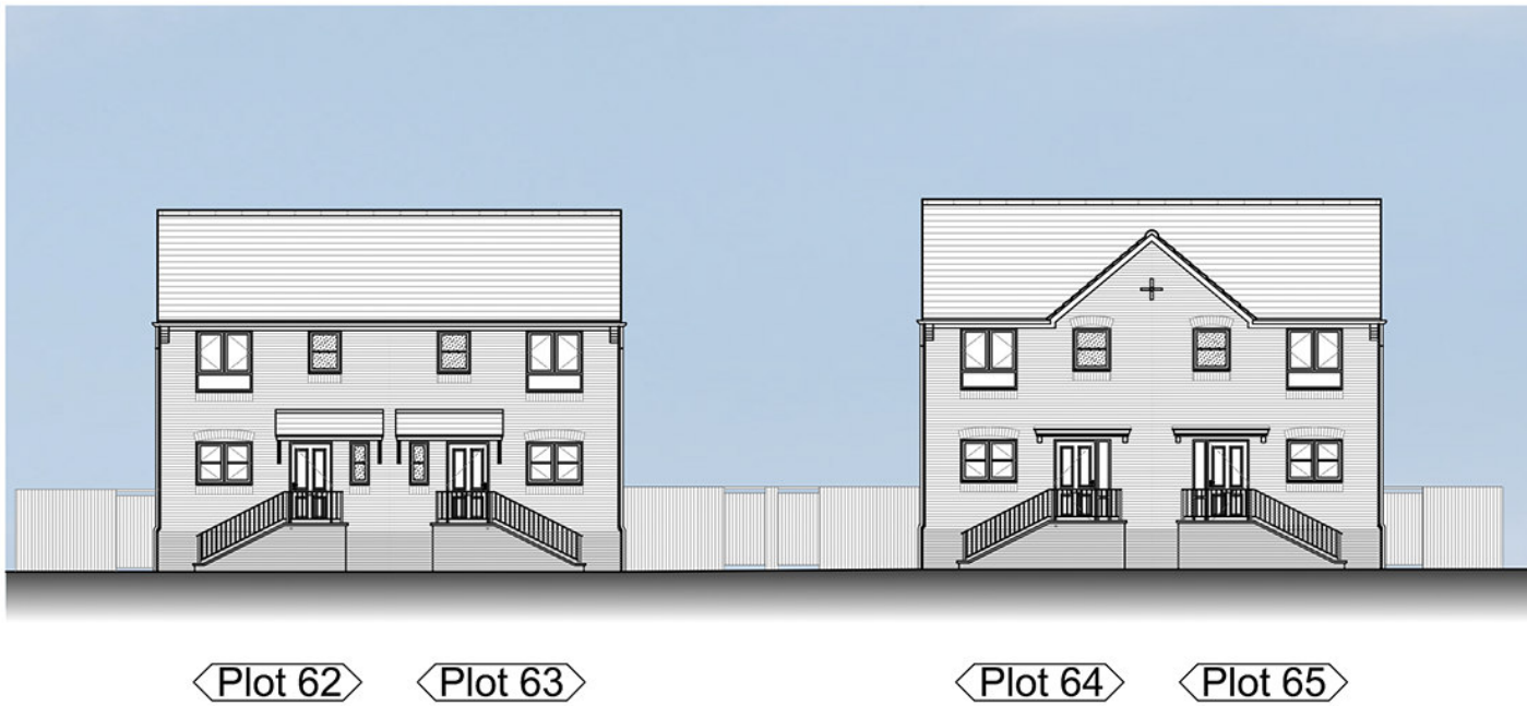
STREET SCENE M