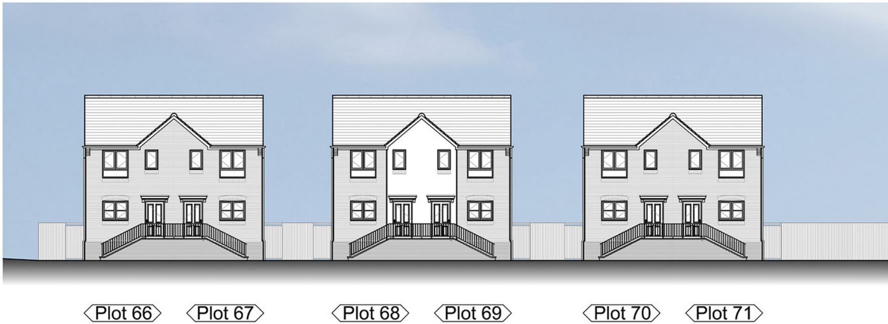
STREET SCENE L