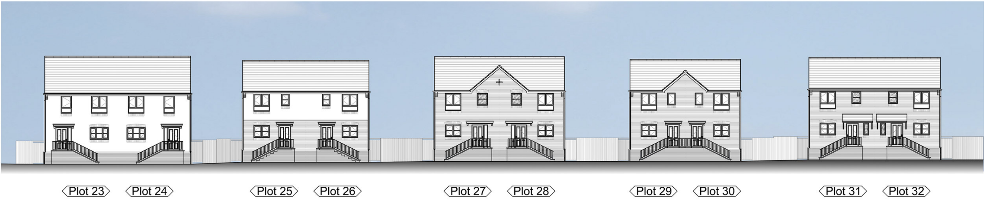
STREET SCENE H