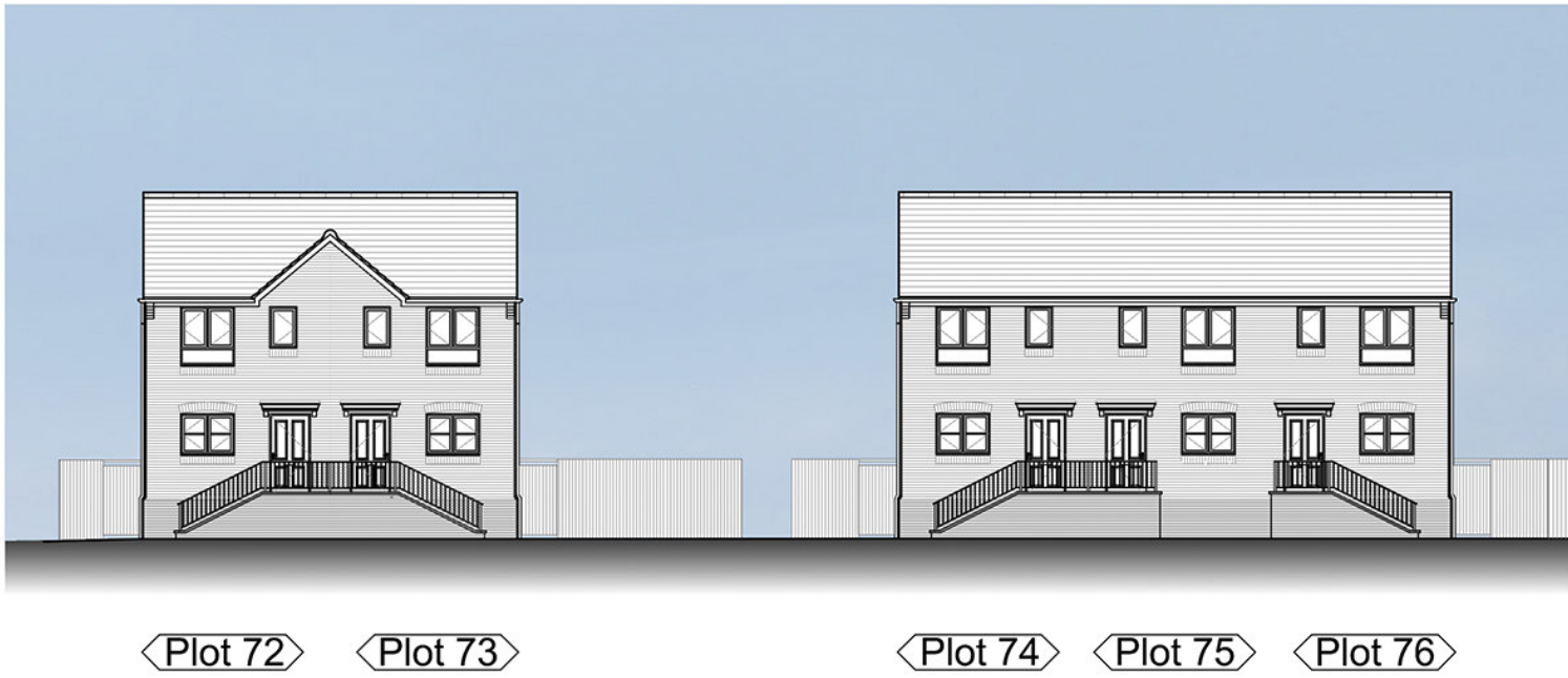
STREET SCENE K