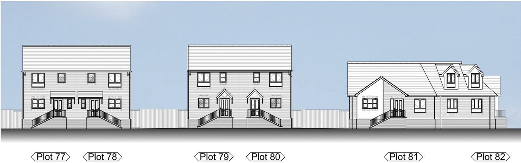
STREET SCENE J