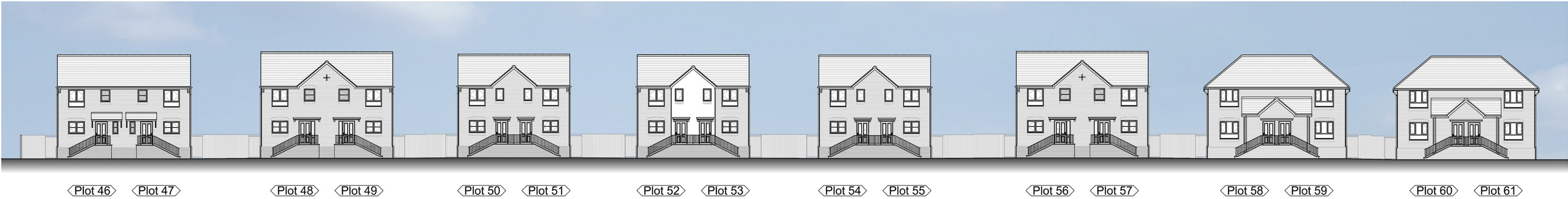
STREET SCENE N

PROJECT: Residential Development Whitehouse Lane Boston Lincolnshire, PE21 0BE