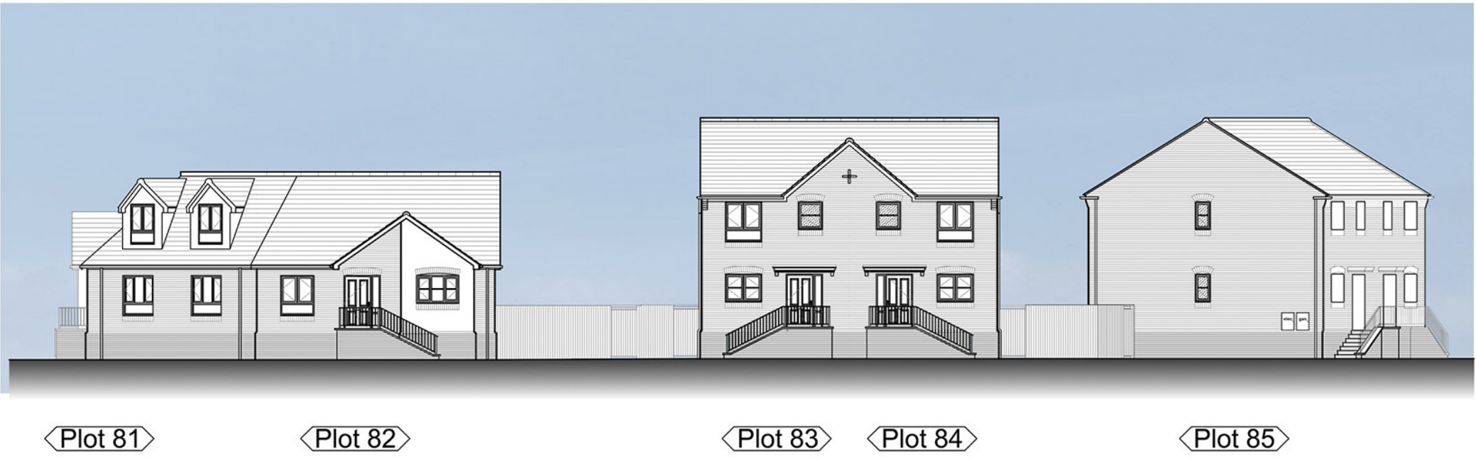
STREET SCENE I