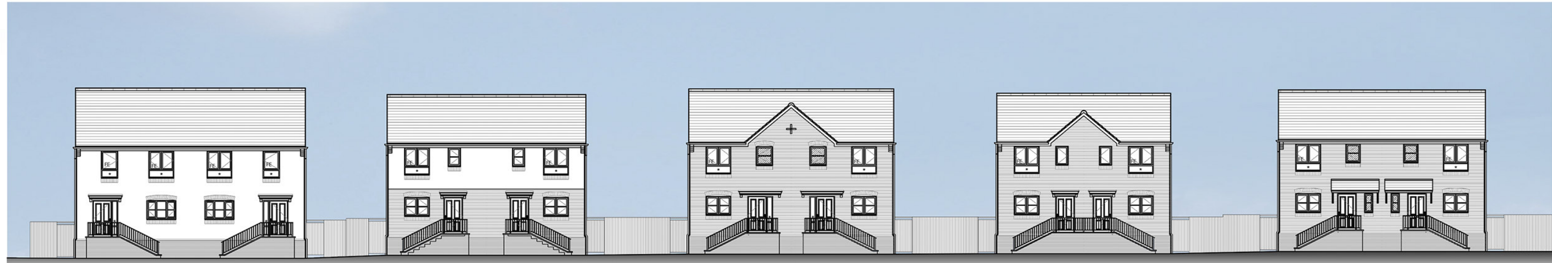
STREET SCENE H

PROJECT: Residential Development Whitehouse Lane Boston Lincolnshire, PE21 0BE