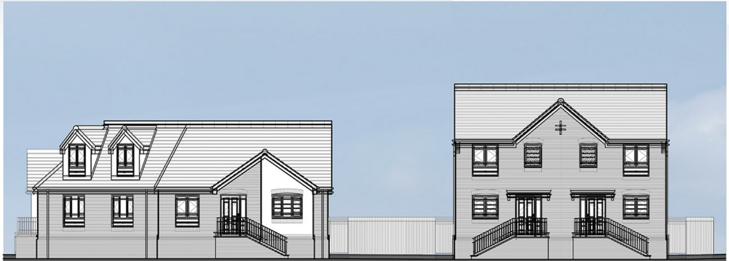
STREET SCENE F