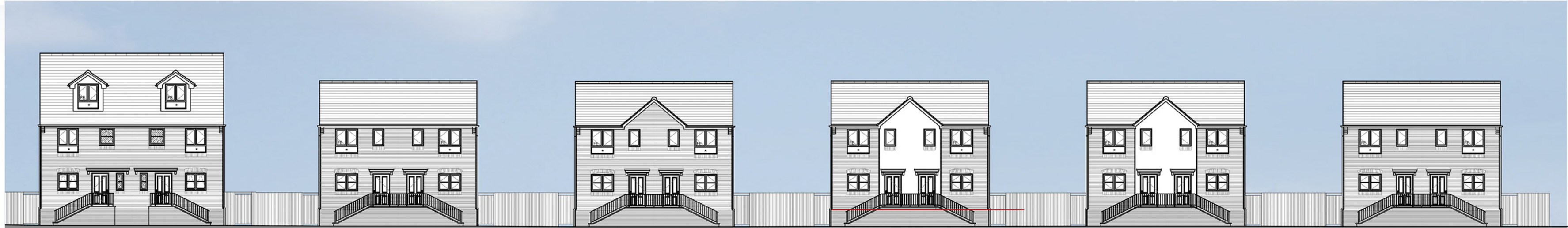
STREET SCENE E