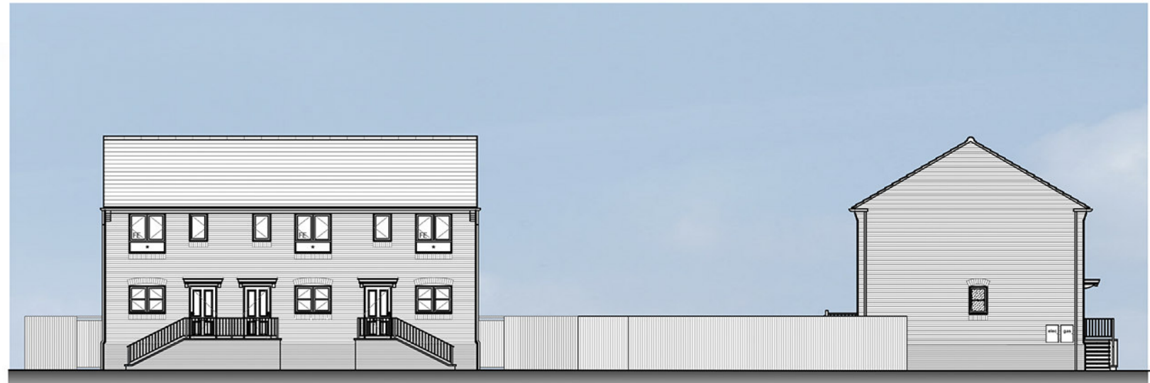
STREET SCENE G