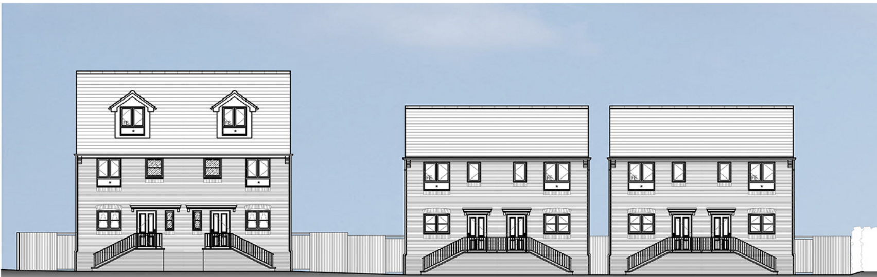
STREET SCENE D