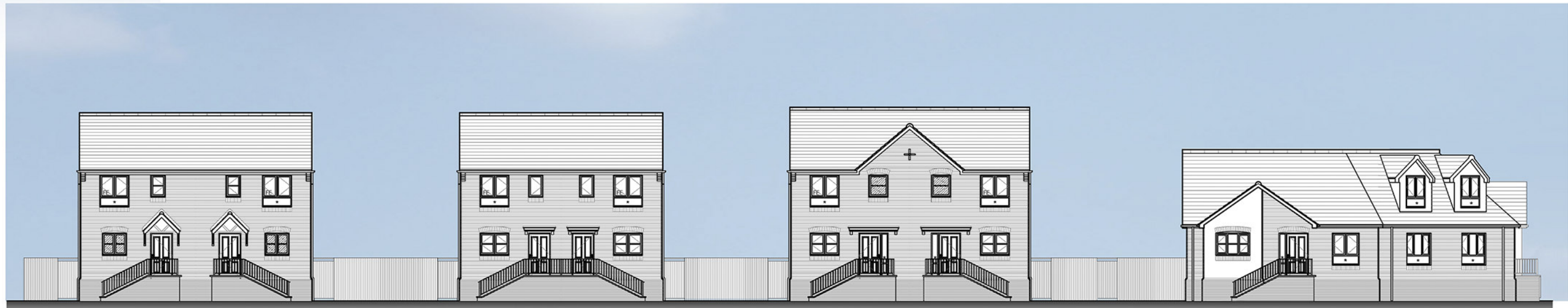
STREET SCENE C