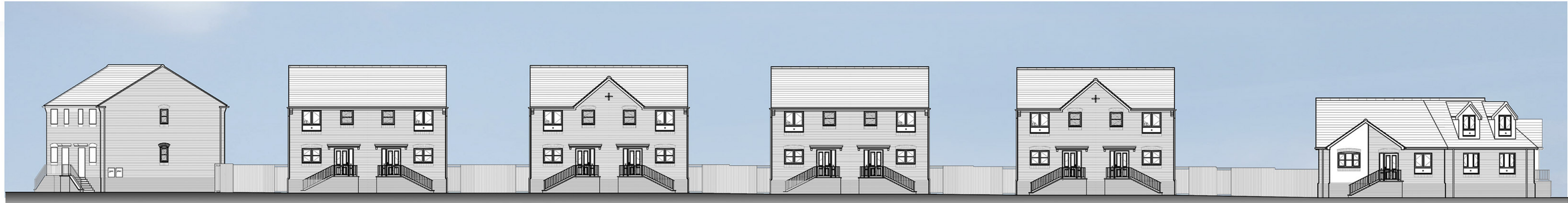
STREET SCENE B