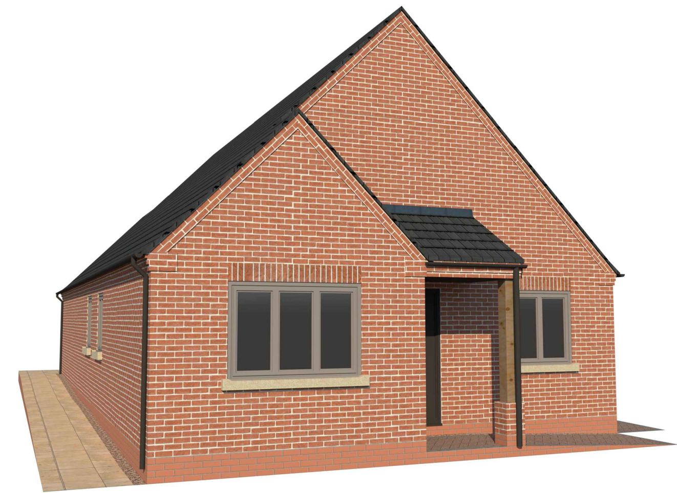
Proposed Front Visuals (n.t.s)