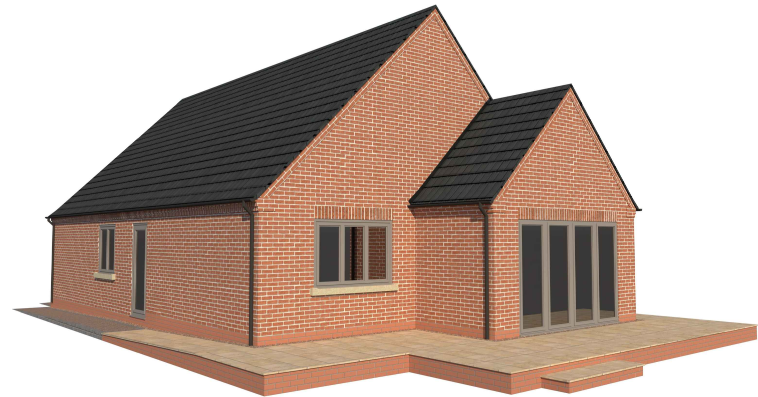
Proposed Rear Visuals (n.t.s)