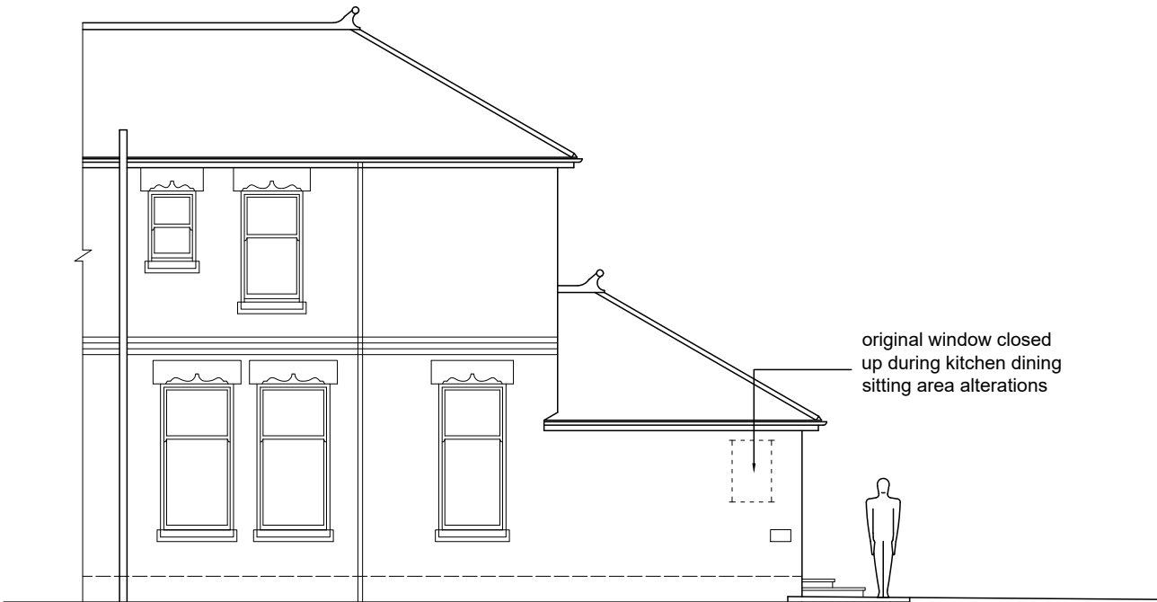
Side Elevation (East) As Existing