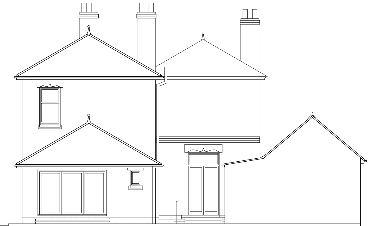
Rear Elevation (North) As Existing