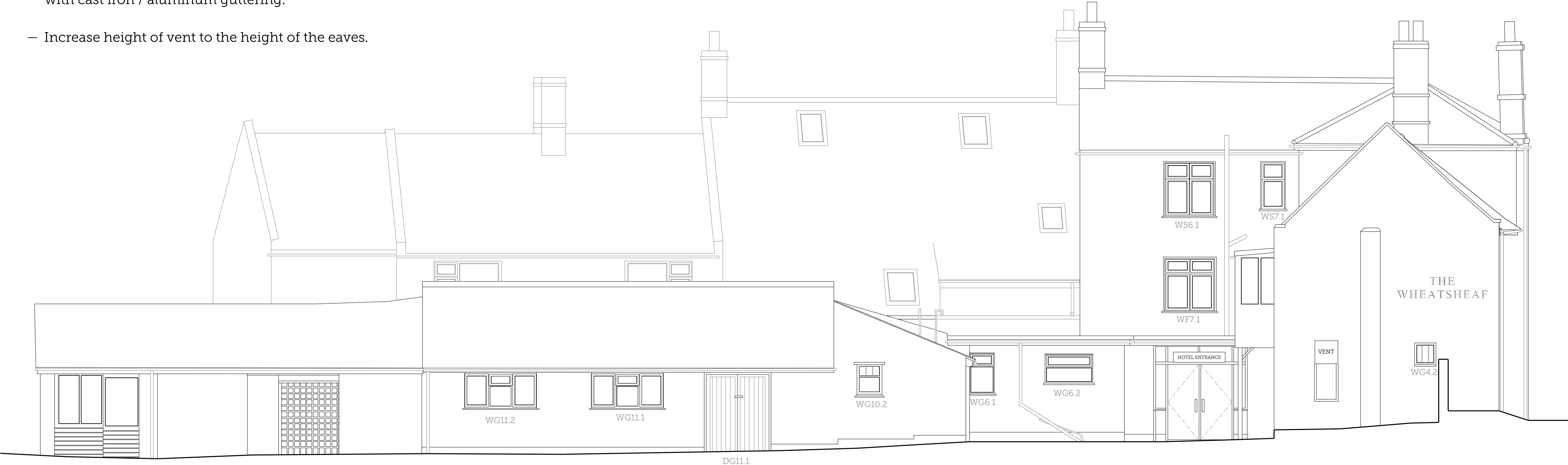
PROPOSED NORTH ELEVATION SCALE - 1:50