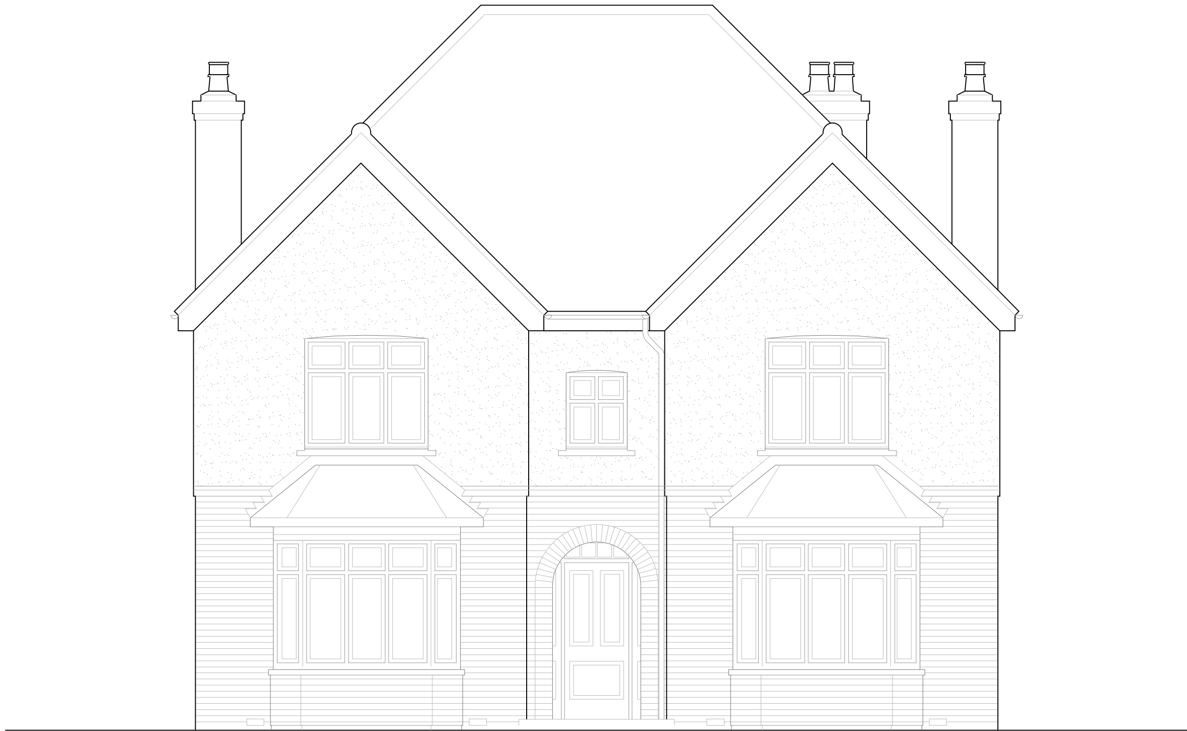
PROPOSED SOUTH ELEVATION Scale 1:50 @ A1