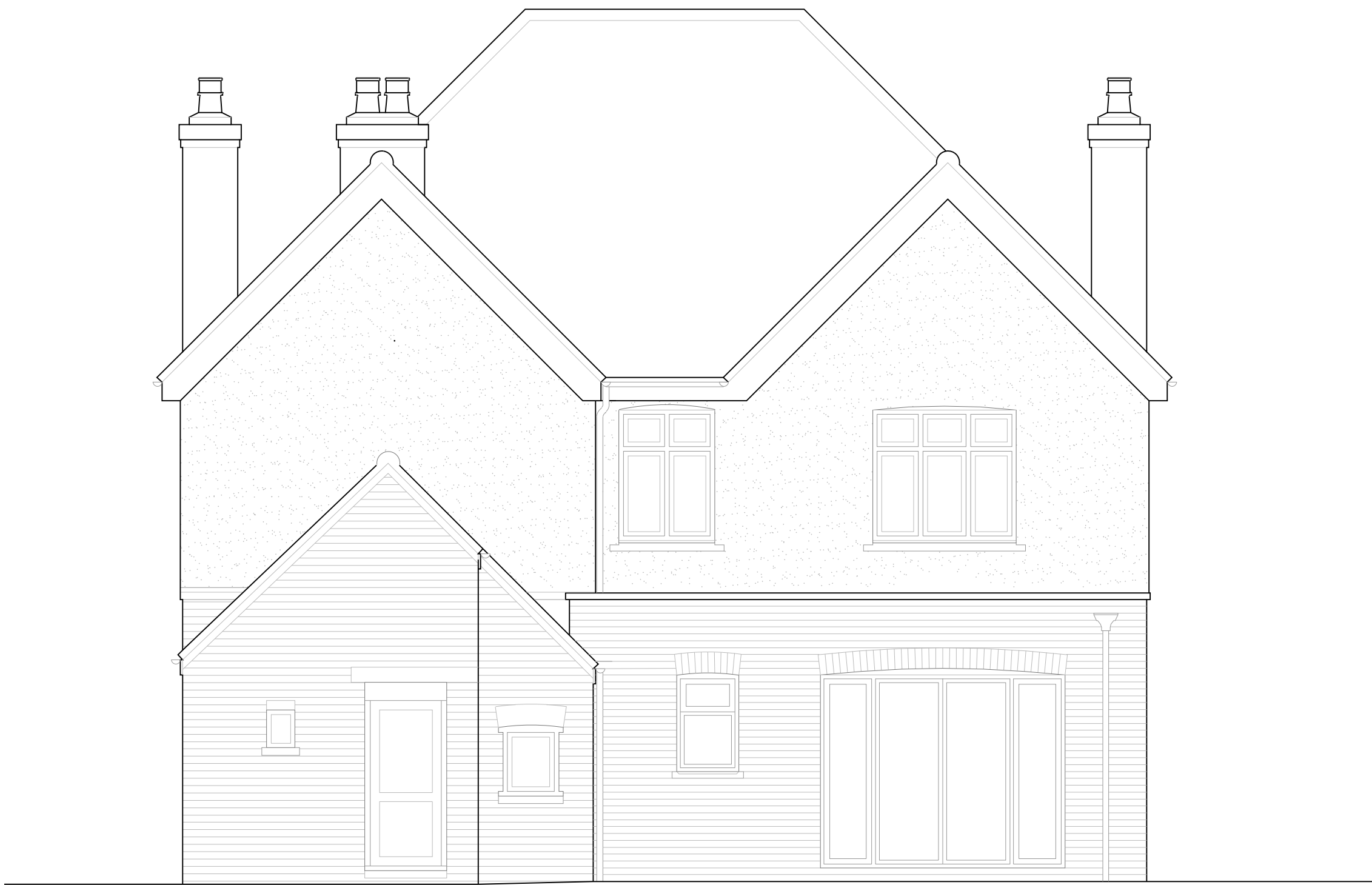
PROPOSED NORTH ELEVATION Scale 1:50 @ A1