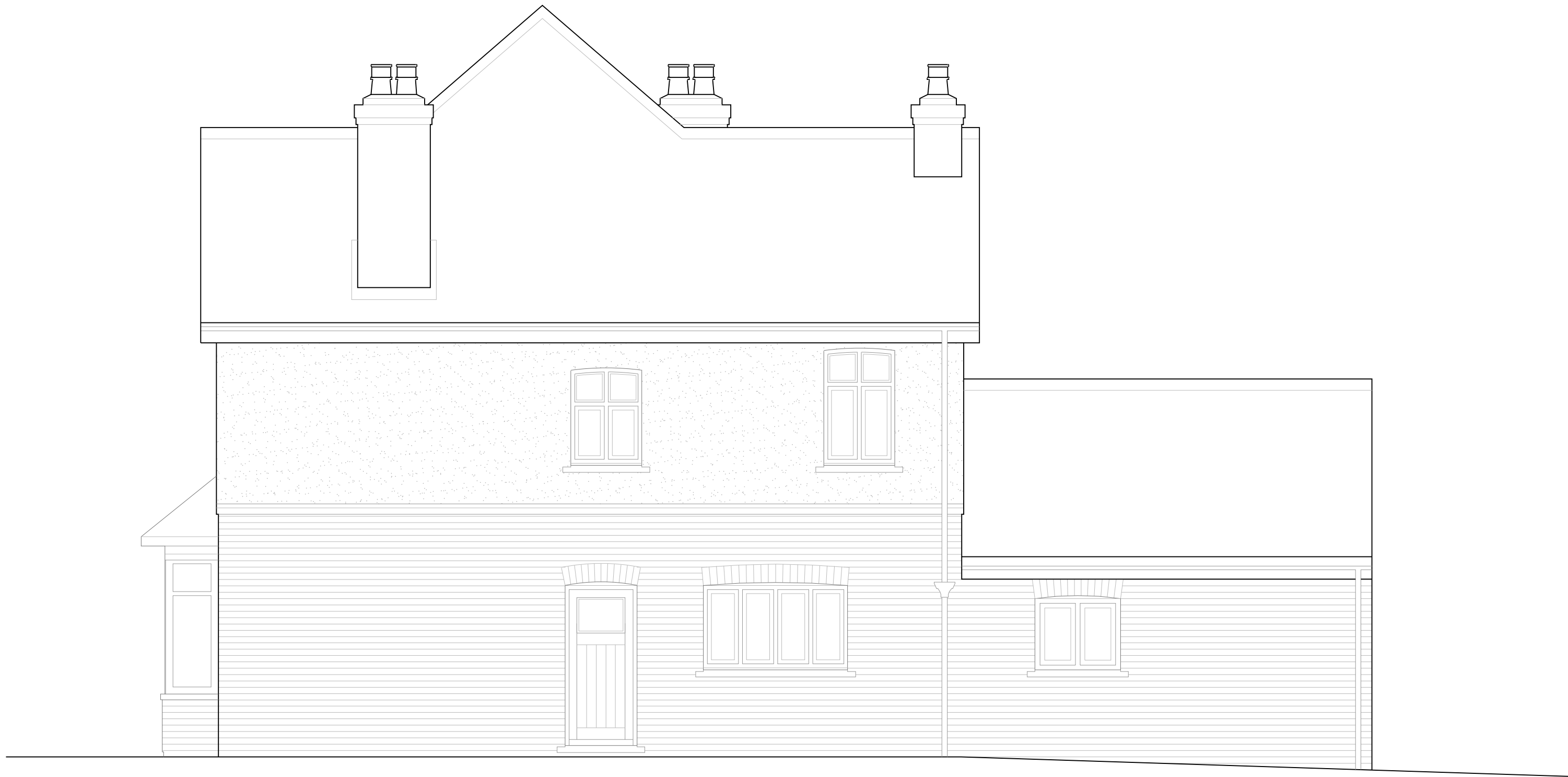
PROPOSED EAST ELEVATION Scale 1:50 @ A1