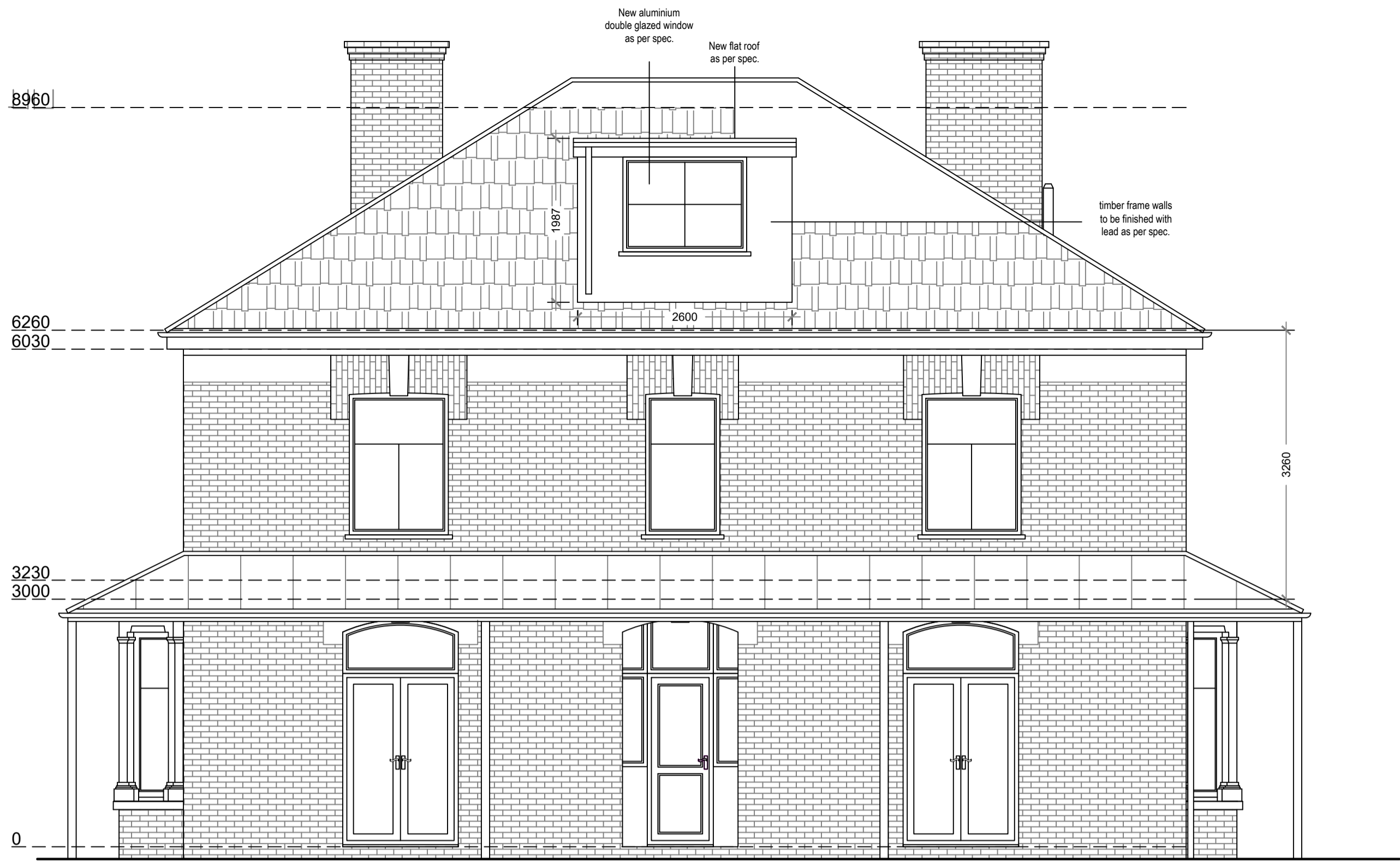
Proposed East Elevation - Option 1&2 Scale 1:50