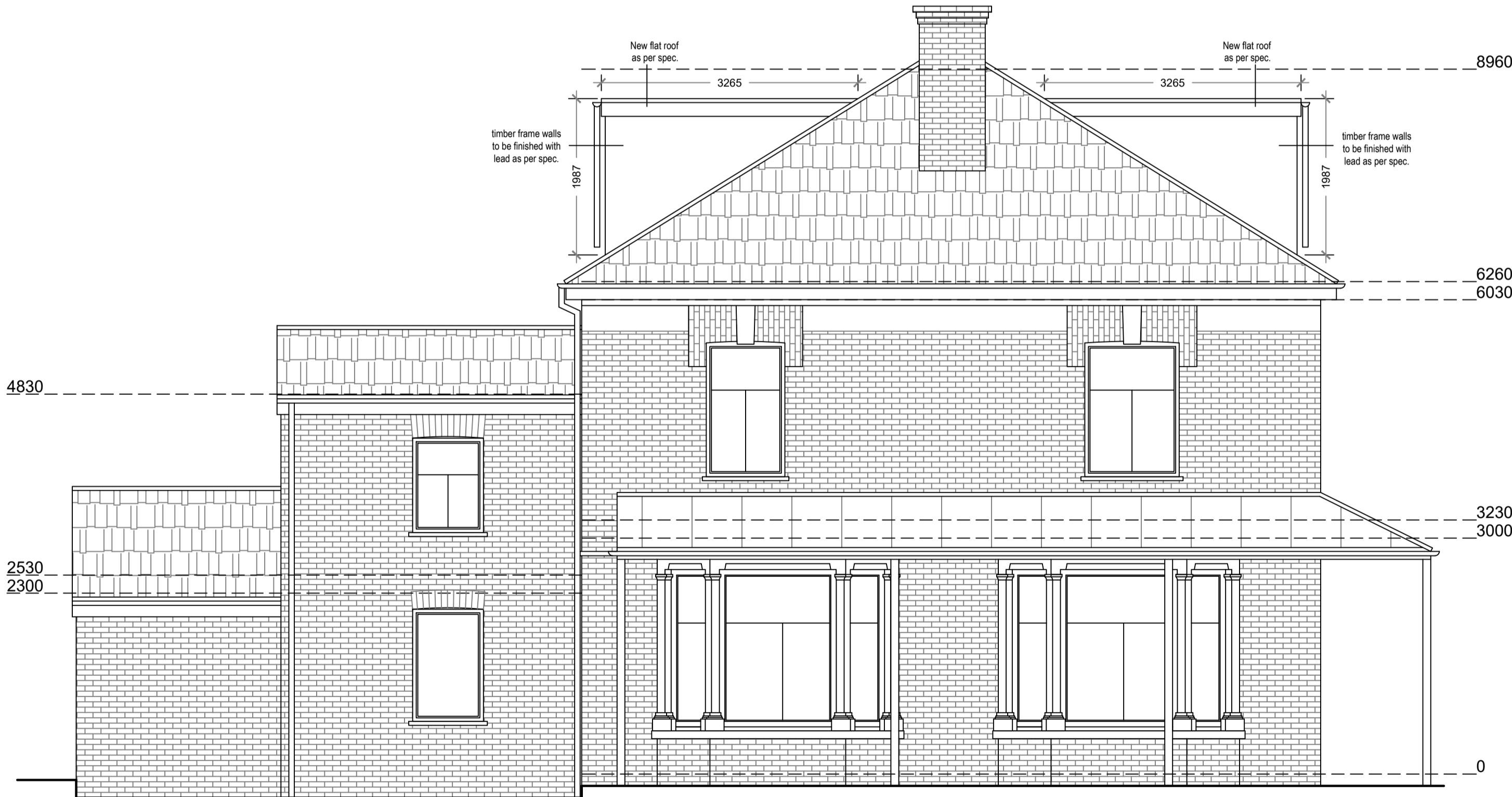
Proposed South Elevation - Option 1&2 Scale 1:50