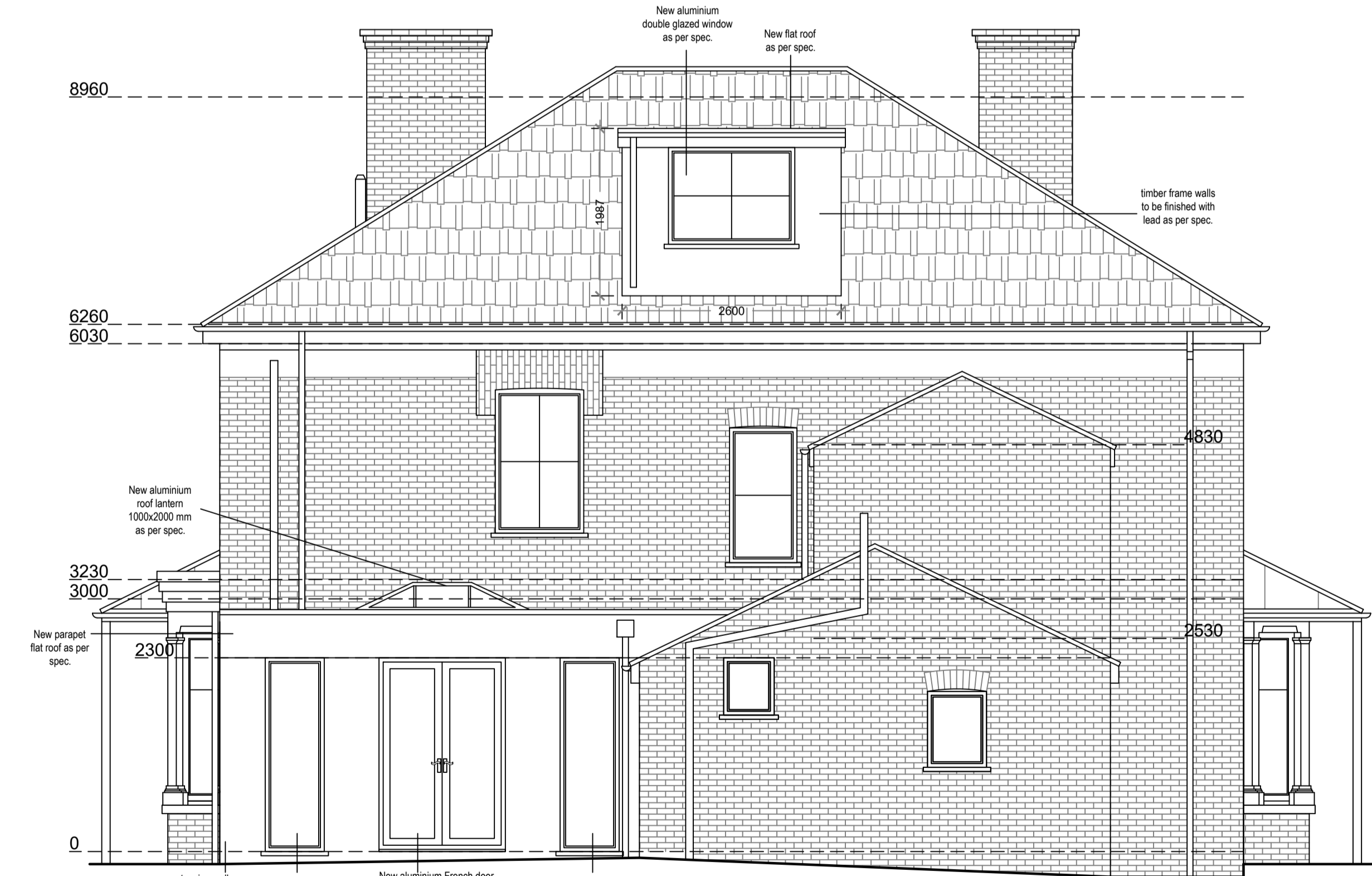
Proposed West Elevation - Option 1&2 Scale 1:50