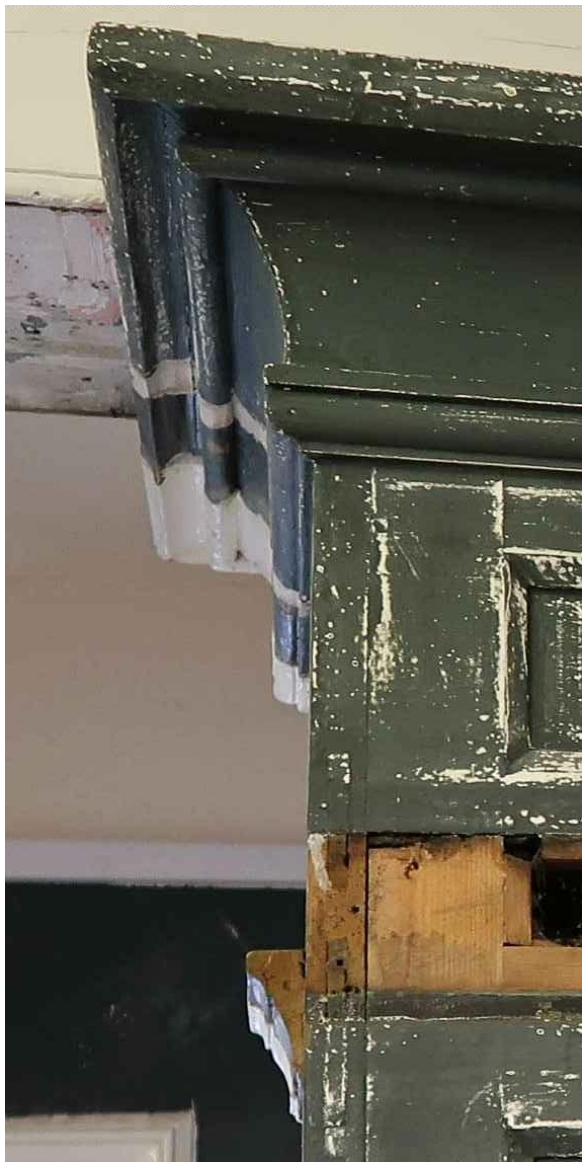
EXISTING ORIGINAL MOULDINGS