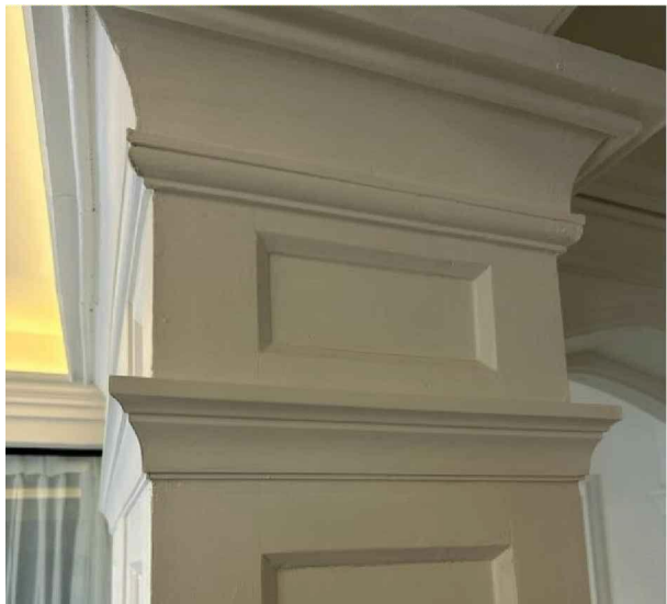
NEW MOULDINGS IN-SITU