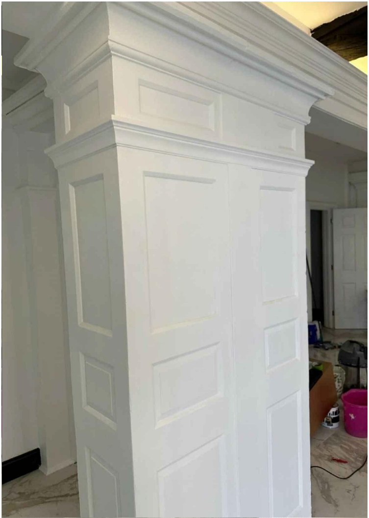
NEW MOULDINGS IN-SITU

General Notes THIS DRAWING IS FOR DESIGN AND PLANNING APPLICATION PURPOSES ONLY AND IS NOT TO BE SCALED FROM OR USED FOR CONSTRUCTION - COPYRIGHT IS RESERVED TO GILICK BROTHERS