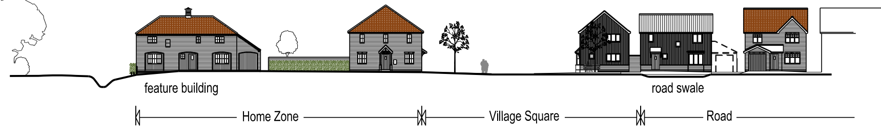
Typical Street Elevation Plots 121, 122, 105, 106, 107

This drawing is a copyright and no portion should be used without consent. No dimensions are to be scaled off this drawing. All dimensions are to be verified on site.