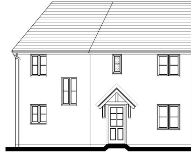
Front Elevation 2