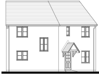
Front Elevation 1