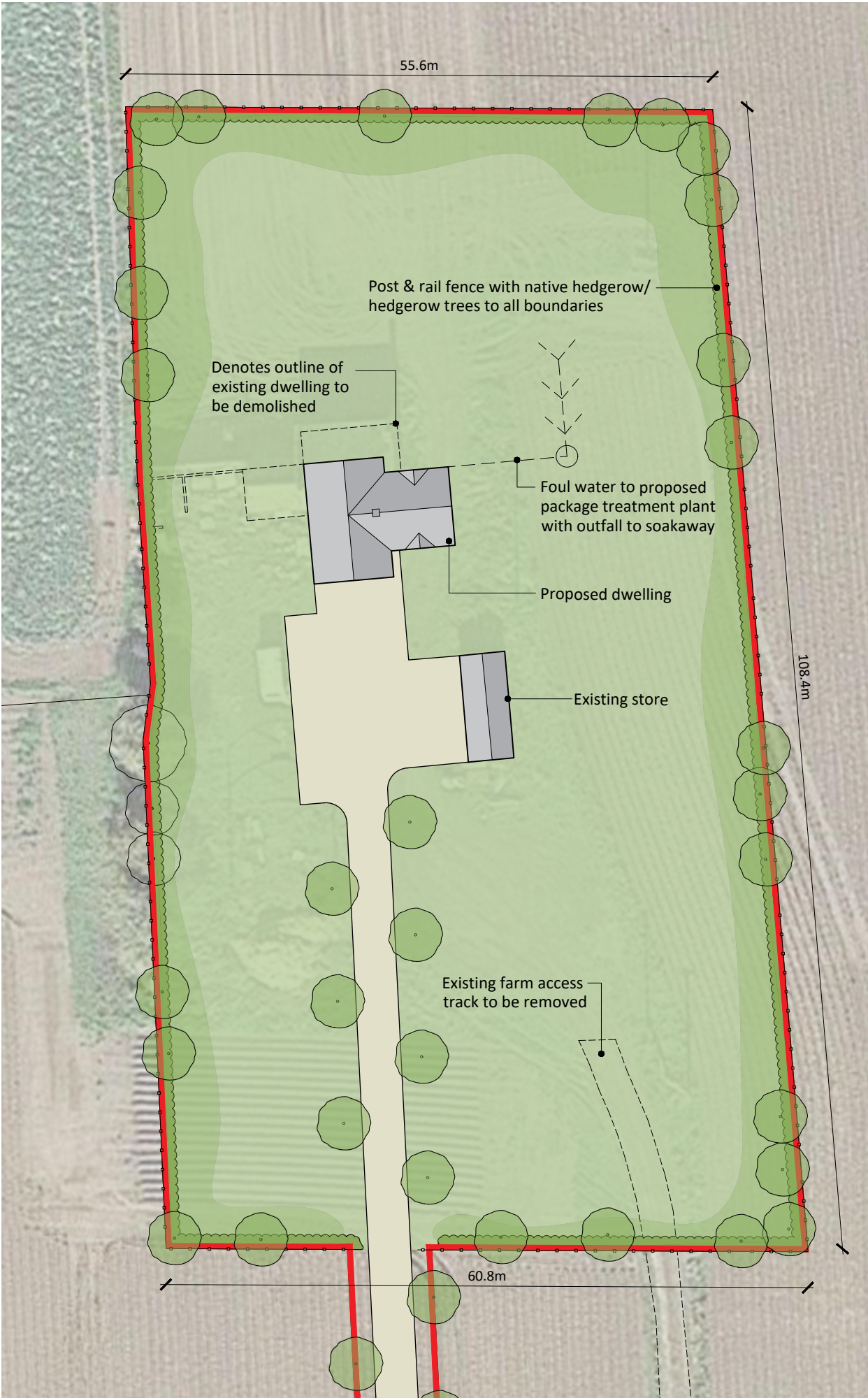
Proposed Site Plan (1:500)