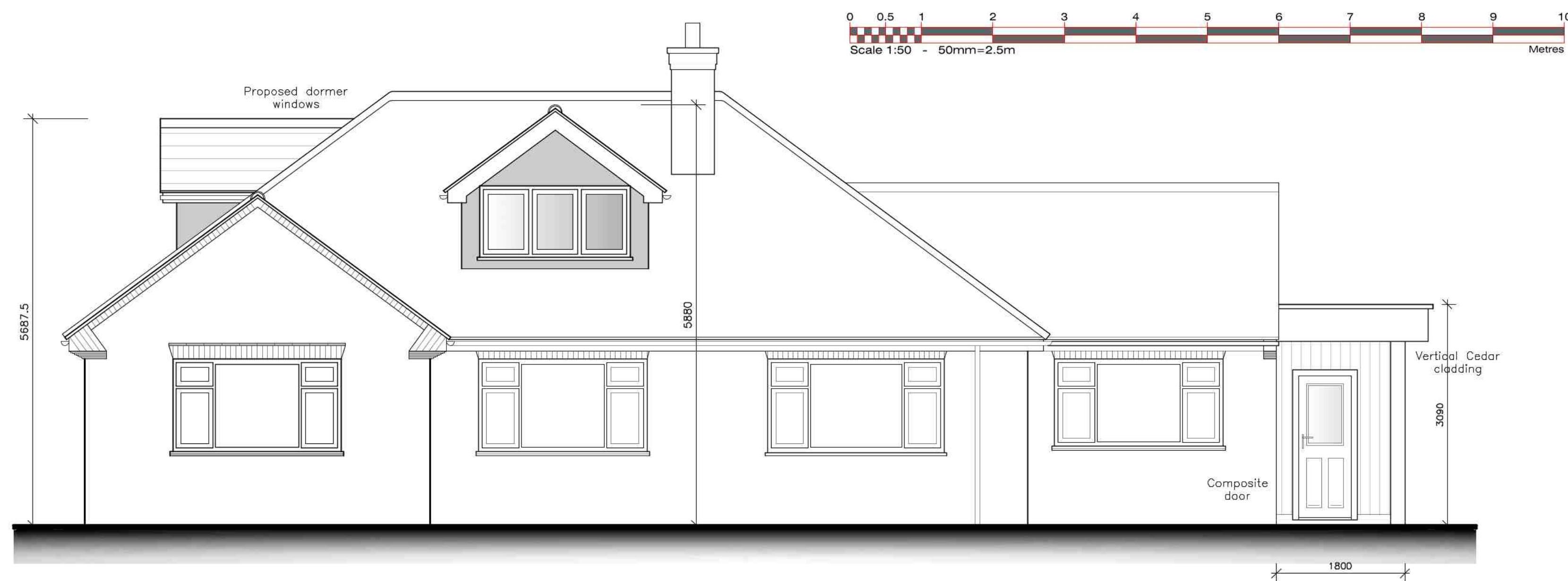
FRONT (NORTH-EAST) ELEVATION SCALE 1:50