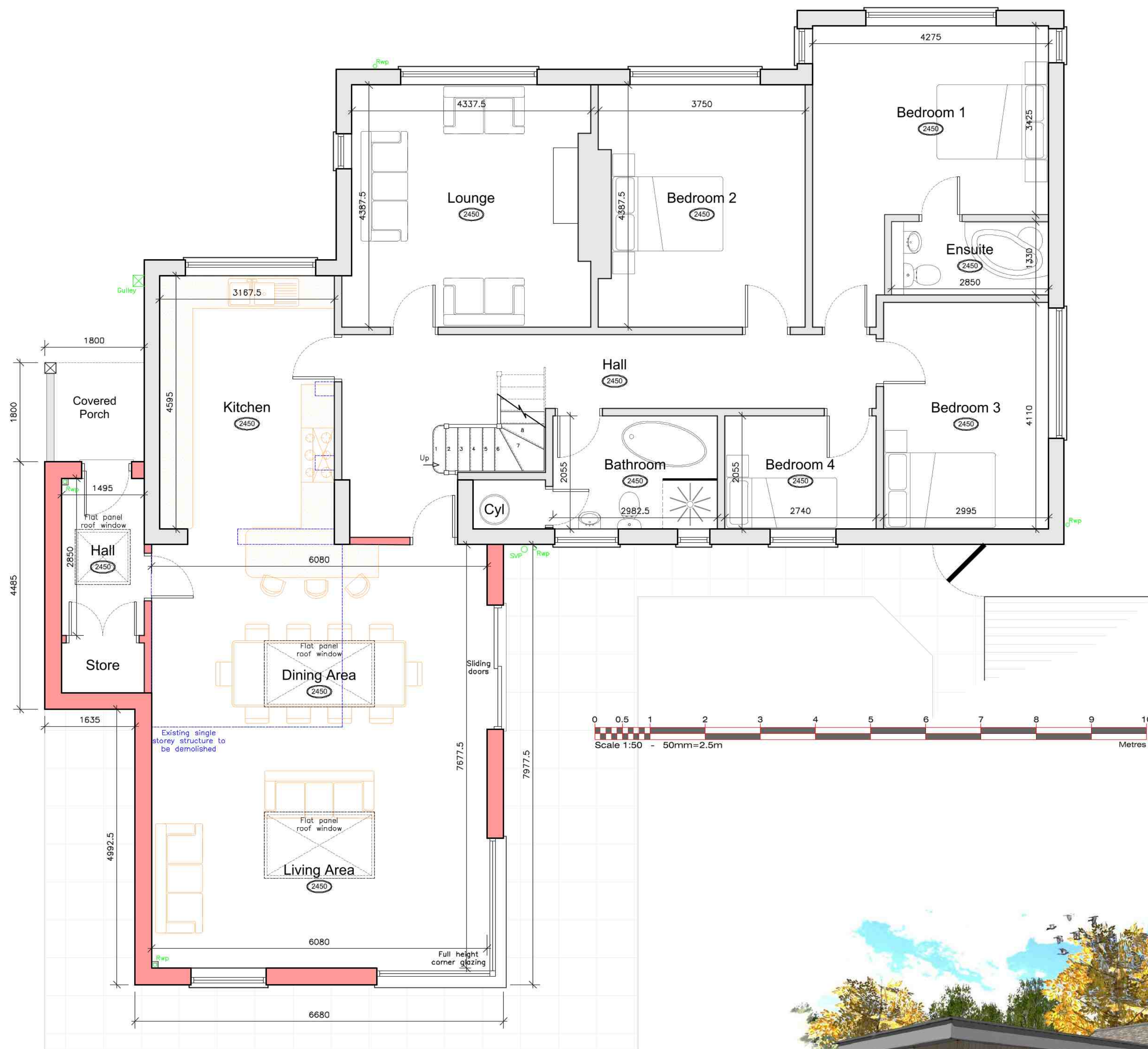
GROUND FLOOR PLAN SCALE 1:50