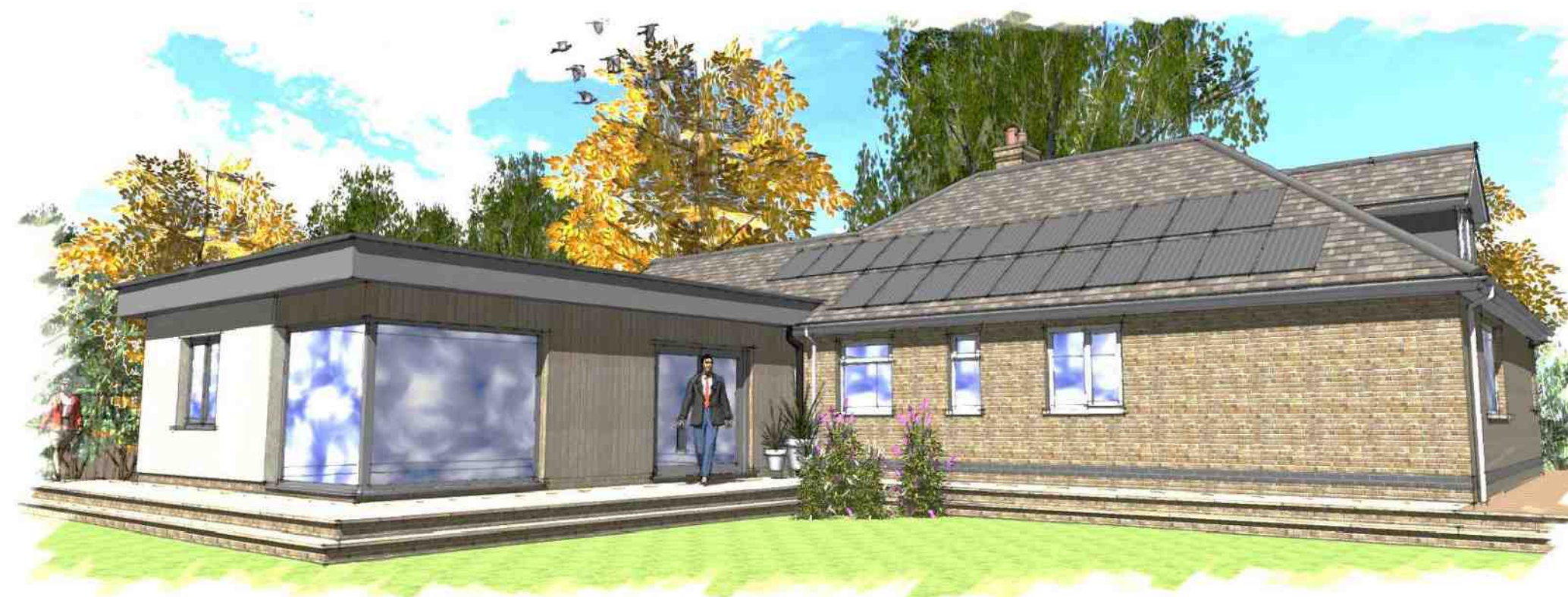
REAR - (SOUTH) VIEW