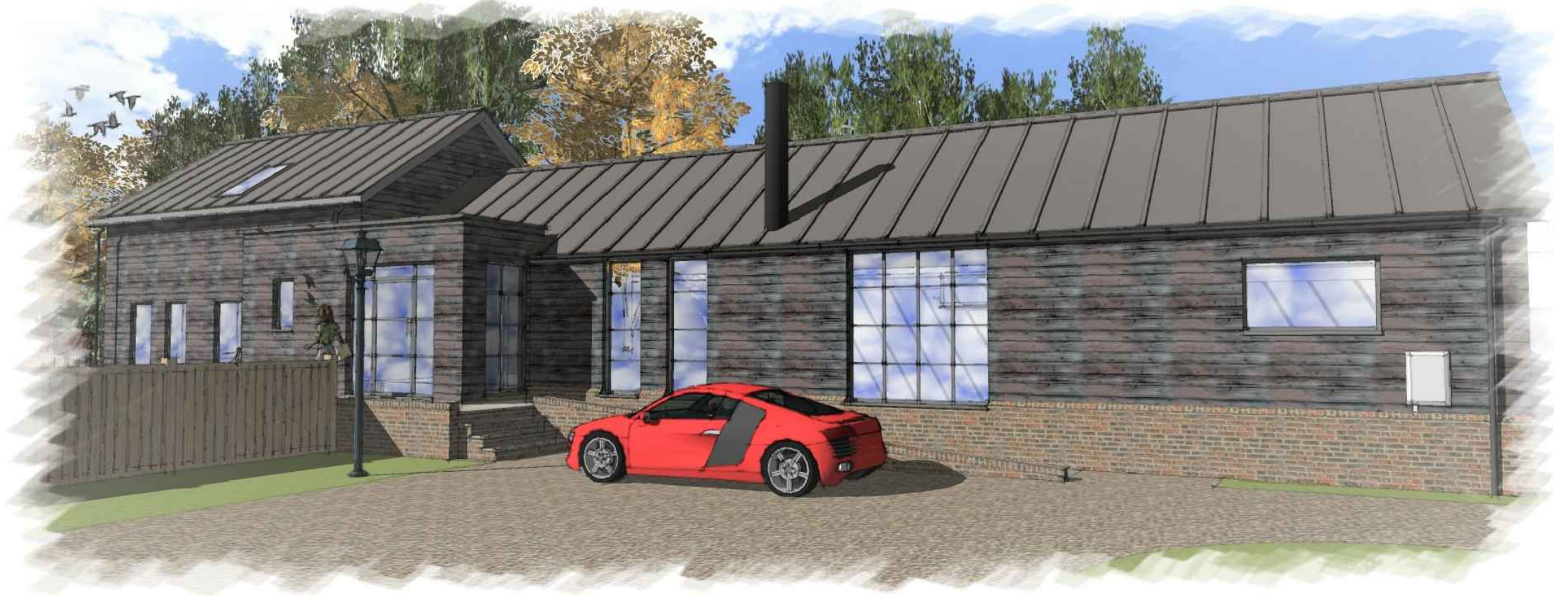
3D SKETCH VIEW FROM EAST