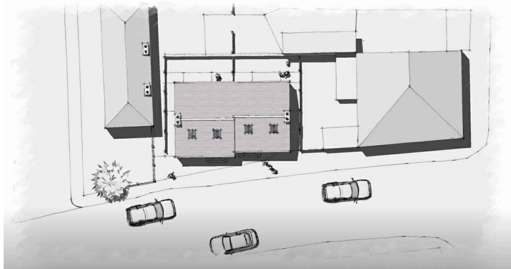
3D SKETCH VIEW 4