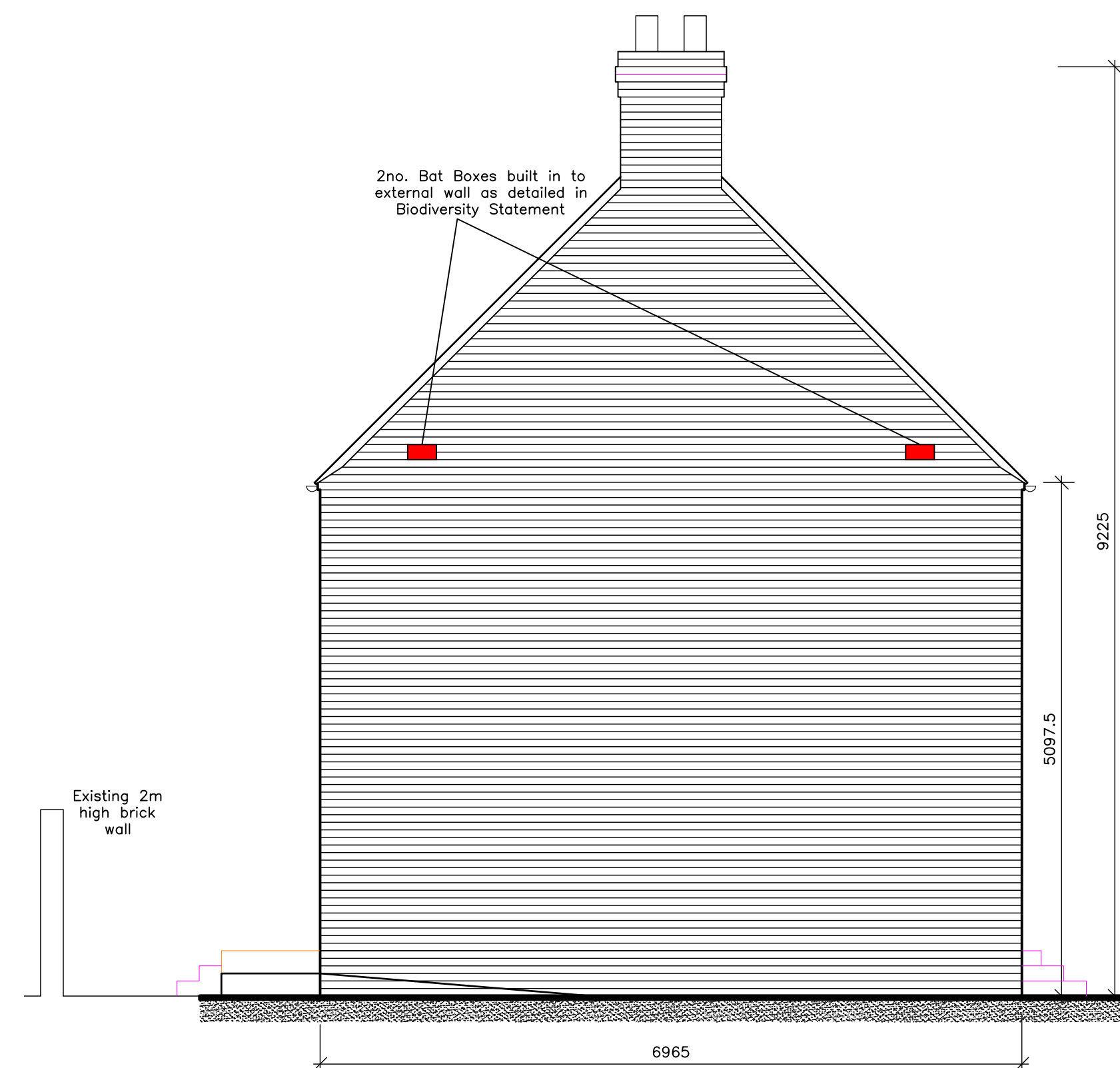
SIDE (SOUTH-WEST) ELEVATION SCALE 1:50

Rev A Elevations changed 29/11/14 Rev B Scale added 09/02/21 Rev C Drawing revised 26/02/21