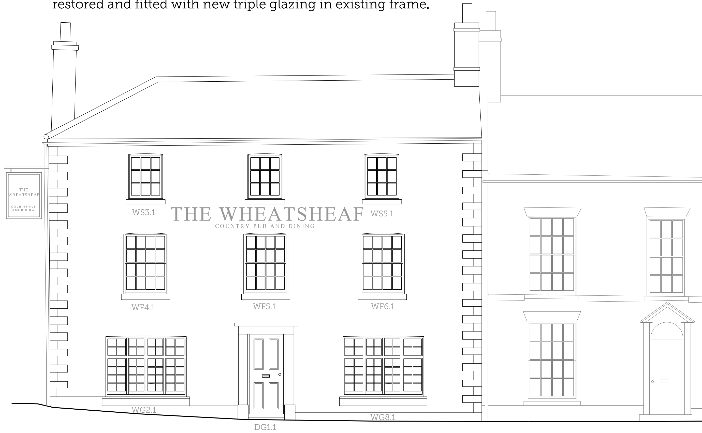
PROPOSED SOUTH ELEVATION SCALE - 1:50