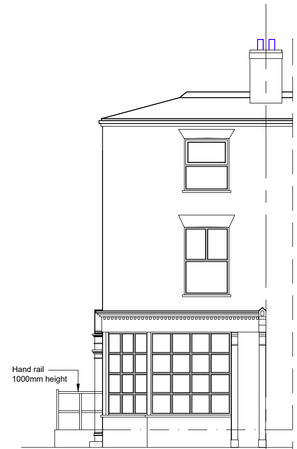
Side Elevation Scale 1:100