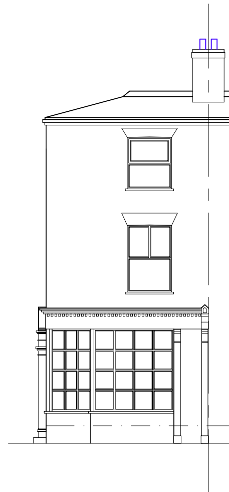
Side Elevation Scale 1:100