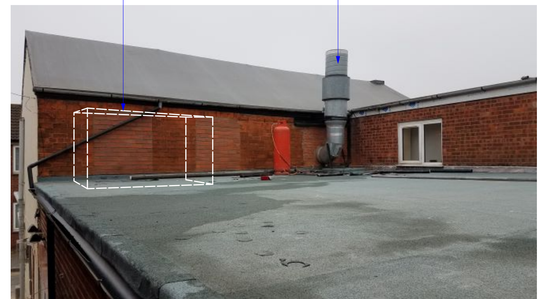
4 PHOTO A Flat Roof

Existing location of kitchen extract remains unchanged. (See PHOTO - A opposite)